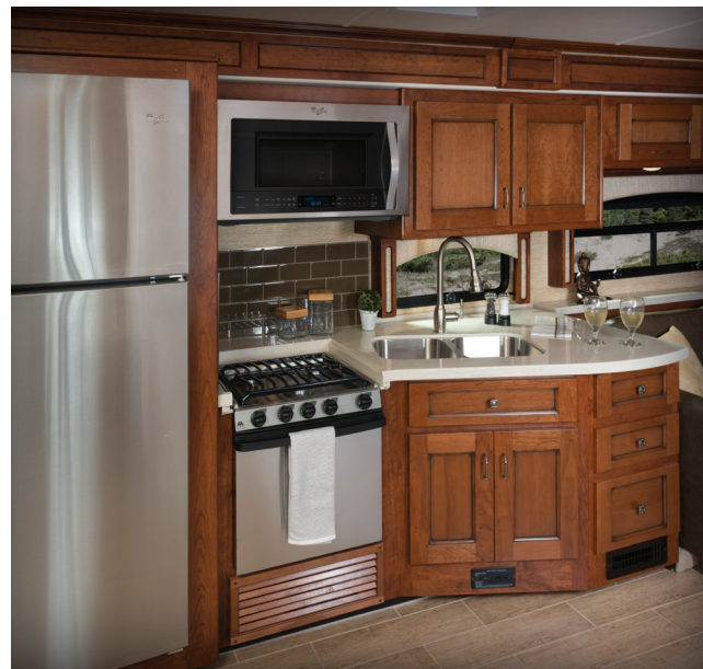
ENDEAVOR 40FX SHOWN IN CITY LOFT DÉCOR WITH HILLSIDE CHERRY WOOD CABINETRY