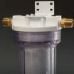
WATER FILTER (STD.)

The Rockwood Roo's compact design expands into a very comfortable living space. Committed to residential-style living on the road, Rockwood Roo incorporates directional reading lights over the sofas, heated mattresses, and the Fantastic Fan enables you to remain comfortable night or day. For a light-weight expandable, Rockwood Roo is designed for you.