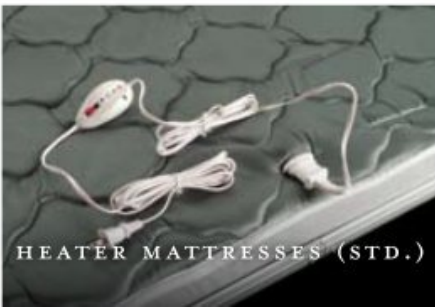
HEATER MATTRESSES (STD.)