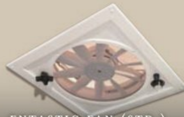
FANTASTIC FAN (STD.)