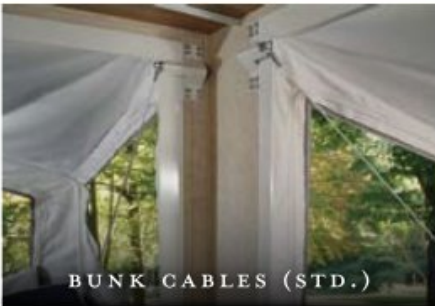
BUNK CABLES (STD.)