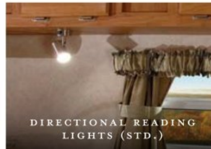
DIRECTIONAL READING LIGHTS (STD.)