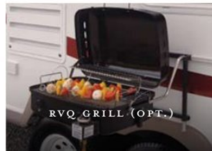
RVQ GRILL (OPT.)