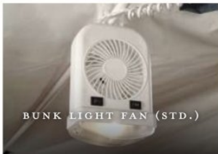
BUNK LIGHT FAN (STD.)