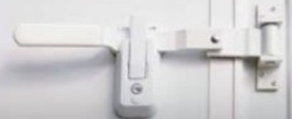
INDUSTRIAL BUNK LATCH (STD.)