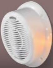
OUTSIDE SPEAKER (OPT.)