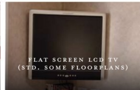
FLAT SCREEN LCD TV (STD. SOME FLOORPLANS)