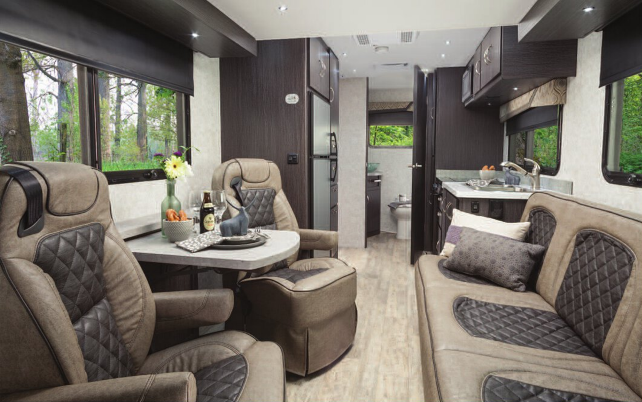
Rev's contemporary interior features LED Lighting throughout, privacy enhancing roller shades and comfortable swivel dinette chairs with integrated seat belts.