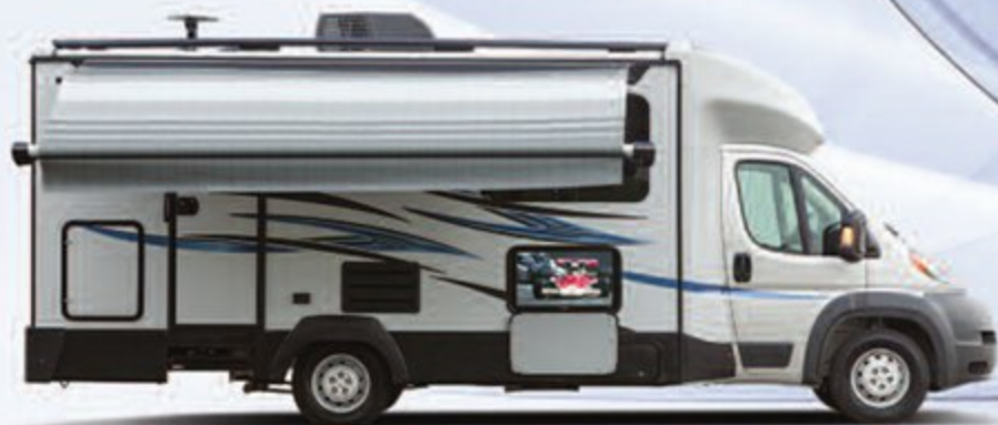
Rev's stylish exterior has an armless dual stage patio awning with LED lighting, dark tinted frameless windows, an outside entertainment center with a 32" TV, plus convenient exterior storage.