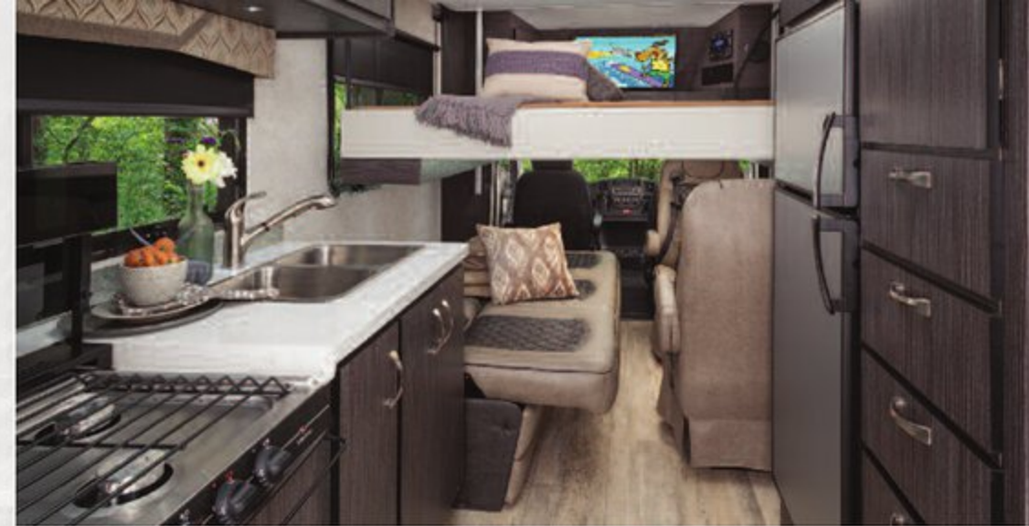
The clean, inviting interior has a spacious queen size electric drop down bed, a 32" LED TV and a convertible jack knife sofa.

Prices, floorplans and specifications subject to change without notice.