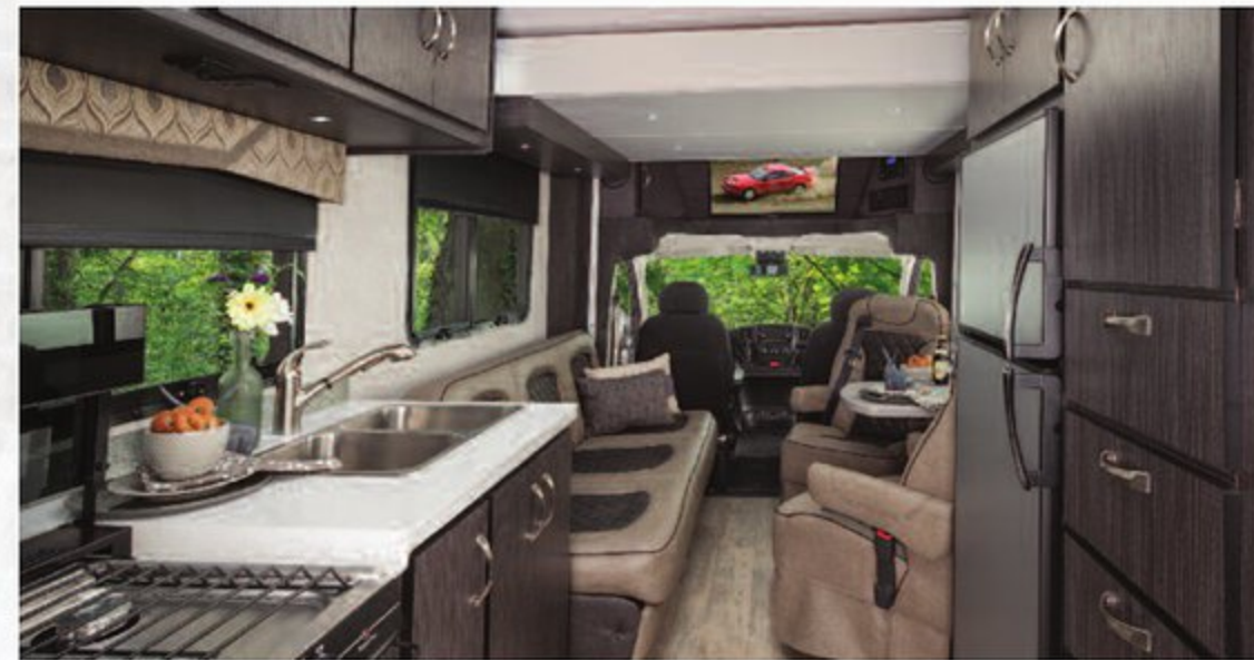
The well appointed galley has a three burner stove top, a seven cu. ft. refrigerator, a solid surface countertop, a tankless hot water heater and plenty of storage.