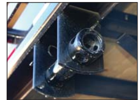
Sliding Strap Ratchets