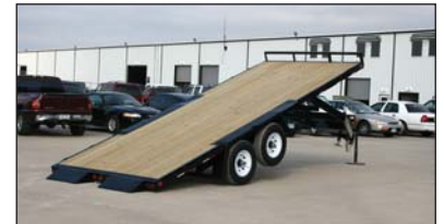
Deck Tilted in High Position