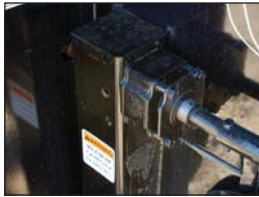
2 Speed Jacks