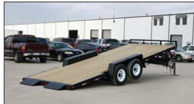
Deck Tilted in Low Position

The patented MultiDeck Tilt by PJ Trailers is one of the most versatile trailers ever built. The trailer can be operated in a low equipment hauler position with a 26" deck height or a high position with a 35" deck height and 102" wide deck. This makes the trailer extremely useful for hauling both narrow or wide track equipment like skid steer and tractors, as well as palletized cargo.