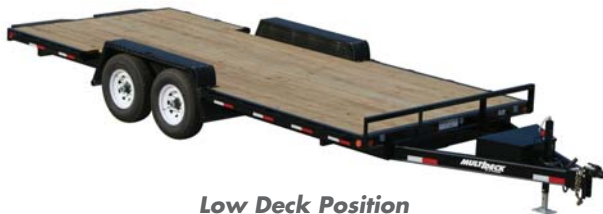
Low Deck Position