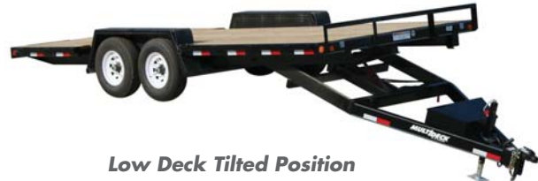
Low Deck Tilted Position