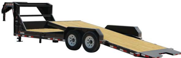
Gooseneck Coupler Available