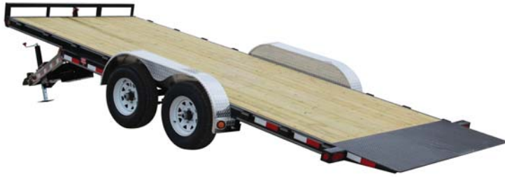
20 ft 83" Hydraulic Quick Tilt Pictured