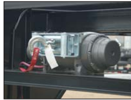
Winch 12VDC (12,000 lb.)