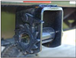
Weld On Strap Ratchets (2)