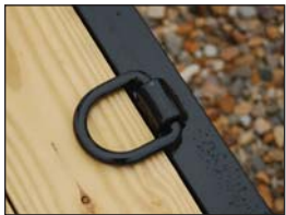
1 Pair D-Rings