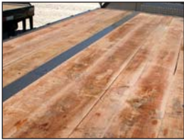
Rough Oak Floor