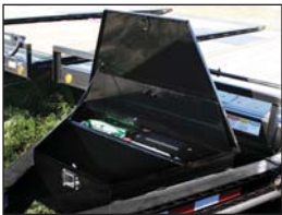
Full Size Divided Toolbox Upgrade (T8 & T9)