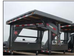
Deck on the Neck (GN Only)