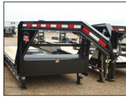
8" I-Beam Gooseneck