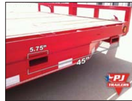
Pallet Fork Holders (T6 & TF)