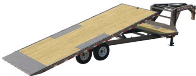
26 ft Grey Gooseneck Deckover Tilt (22' Tilt + 4' Stationary Deck)