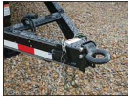
3" Pintle Eye