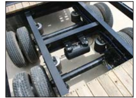
TRAILER FLEX TrailerFlex Air Ride Suspension