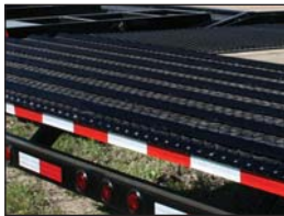
1x1 Angle Traction Bars on Rear of Deck (T8, T9, & TD)