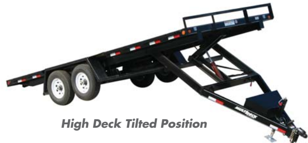
High Deck Tilted Position