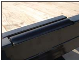
Winch Cable Roller