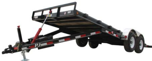
20 ft 83" Hydraulic Quick Tilt Front View

†Weights are estimated for base trailer only, PJ Trailers makes no guarantee regarding the accuracy of estimated weights