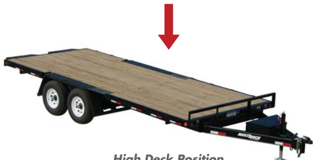
High Deck Position