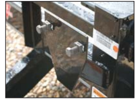
Spare Tire Mount