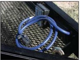
Cold Weather Wiring Harness (7-Way RV)