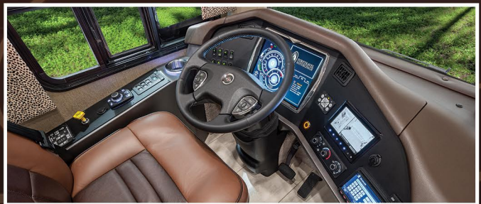
Haptic Warning System on Driver Chair

The Foretravel REALM FS450 perfectly combines power, prestige & performance!