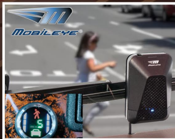
Mobile-eye® Collision Avoidance System