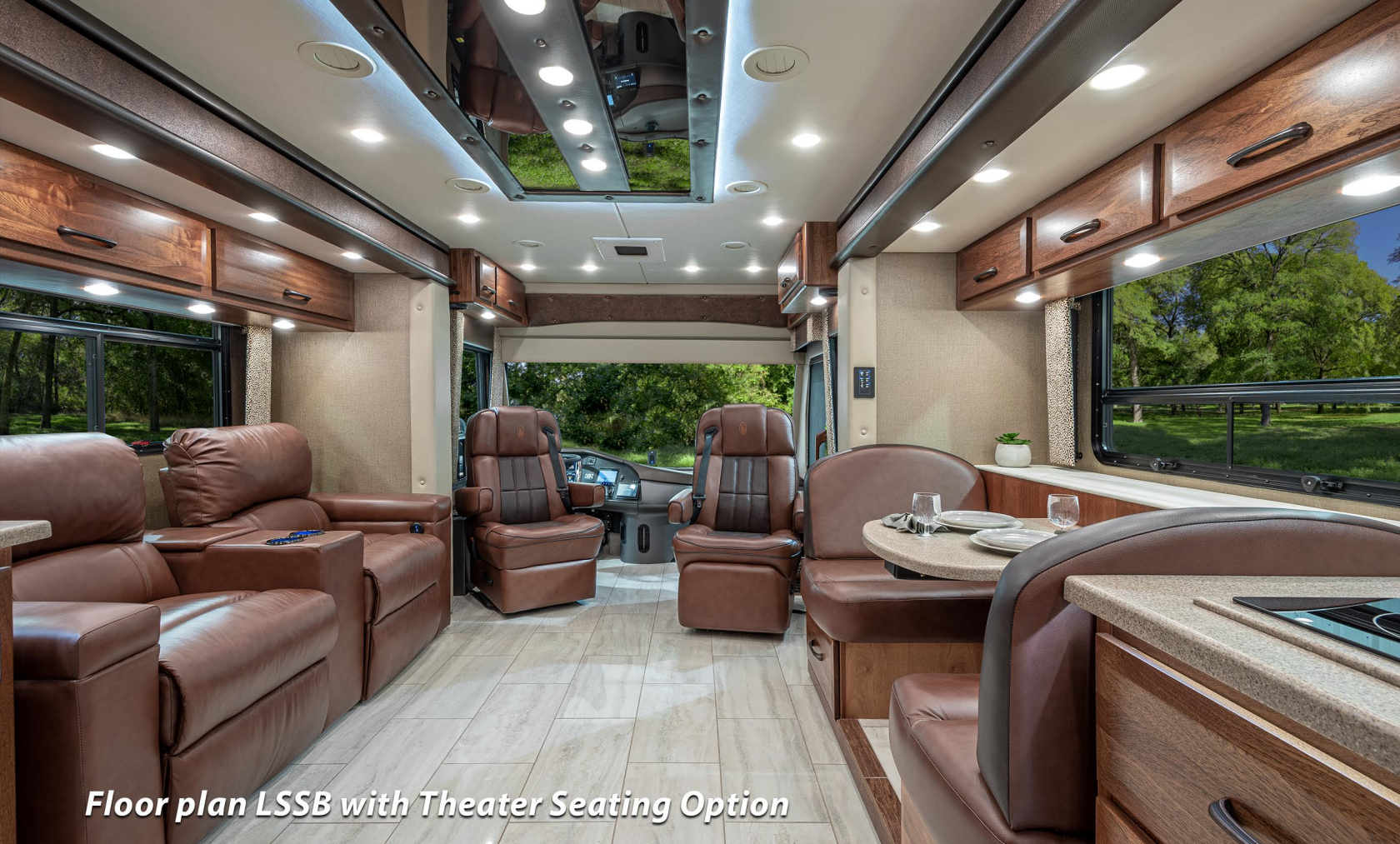
Floor plan LSSB with Theater Seating Option