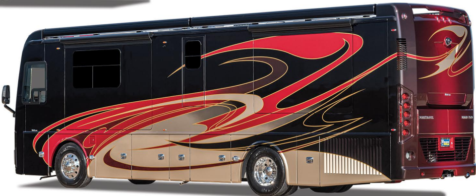
Shown in Apollo paint