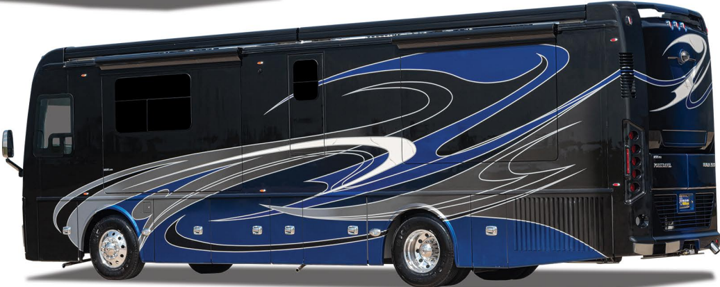
Shown in Imperial paint