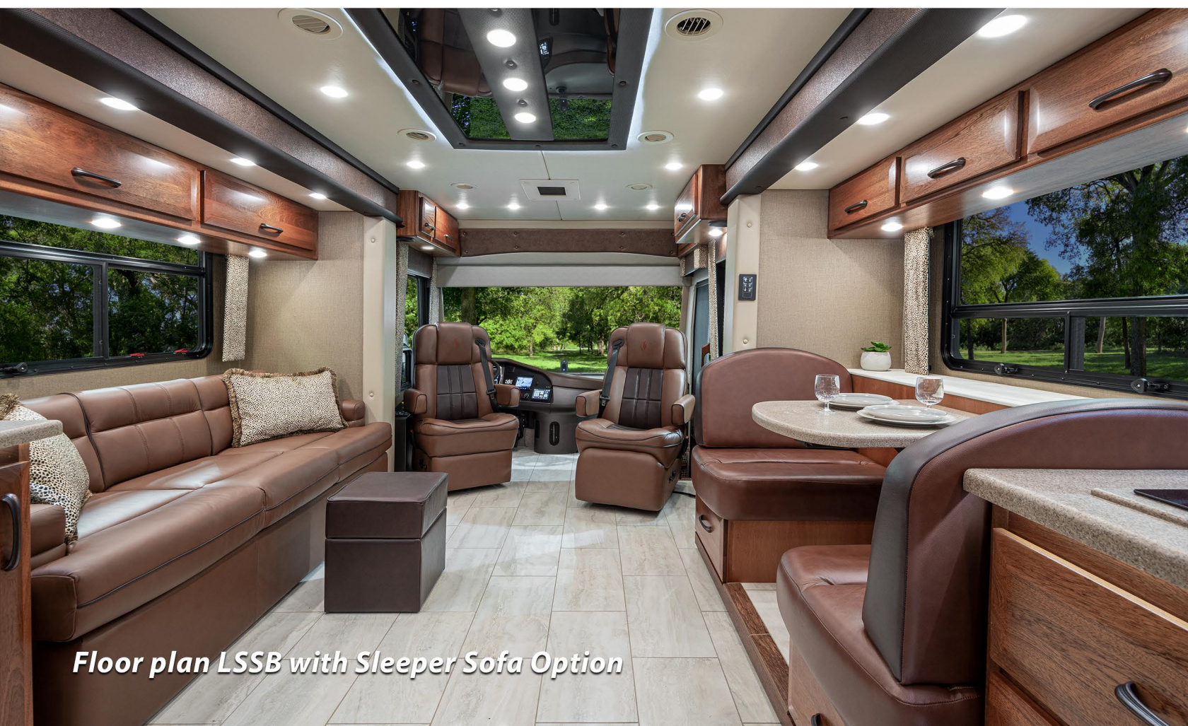
Floor plan LSSB with Sleeper Sofa Option