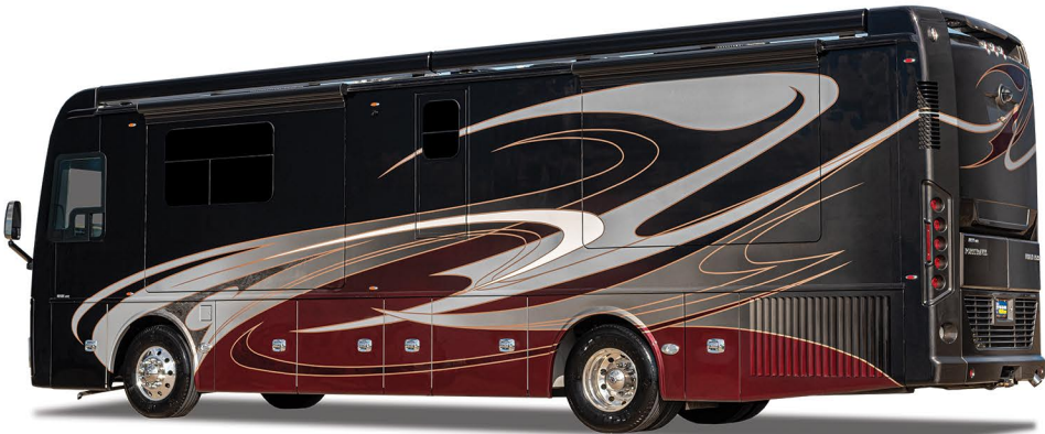
Shown in Sterling paint