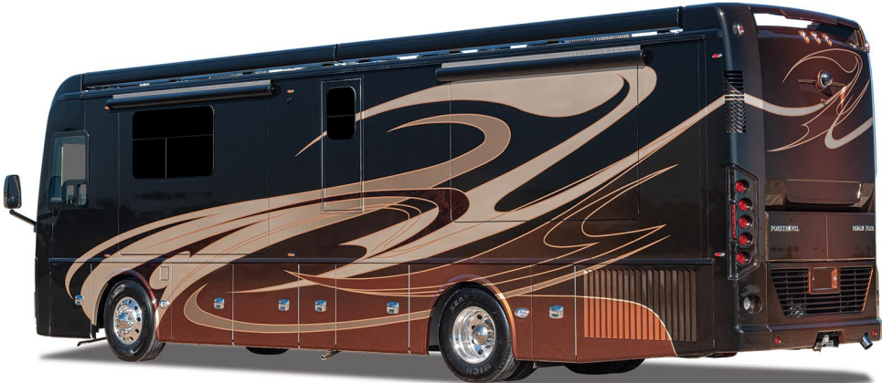
Shown in Crossbow paint