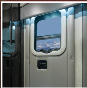
Rear Exit Door