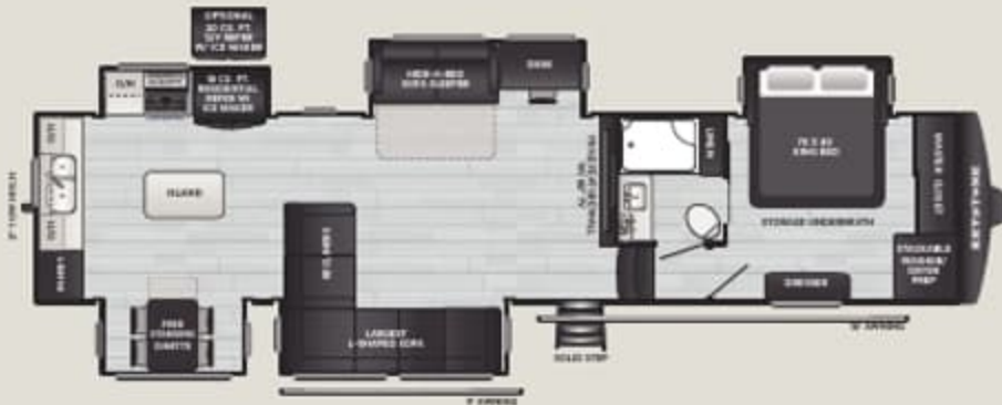
366LS | WEIGHT 14027 | LENGTH 40' 10"