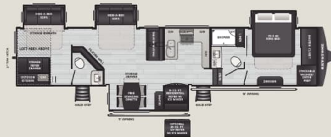
380LT | WEIGHT 14305 | LENGTH 42' 4"