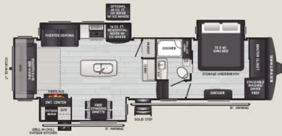
302RS | WEIGHT 11898 | LENGTH 35' 9" 4