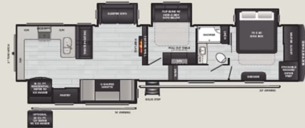
379MB | WEIGHT 14445 | LENGTH 41' 11"