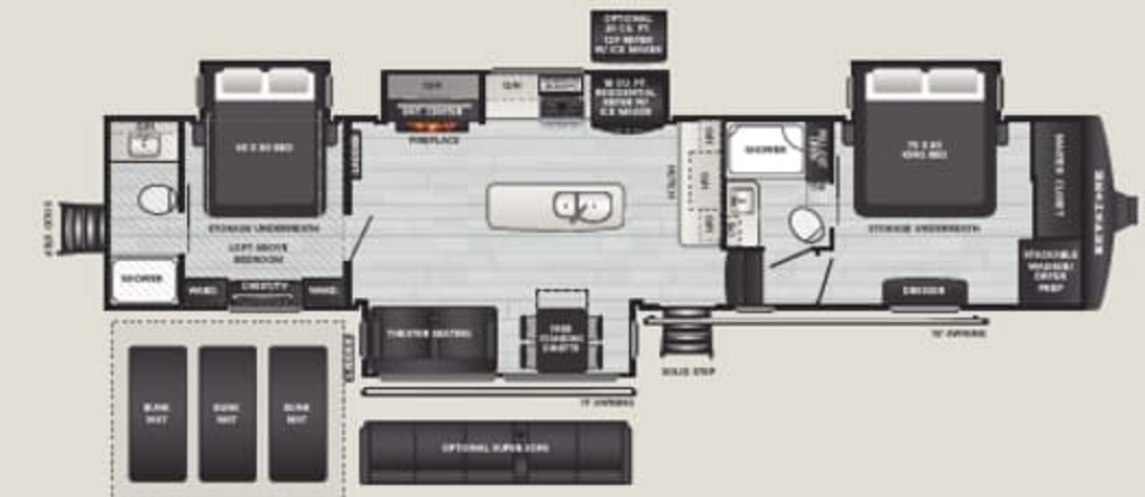
390DS | WEIGHT 14258 | LENGTH 42' 11"