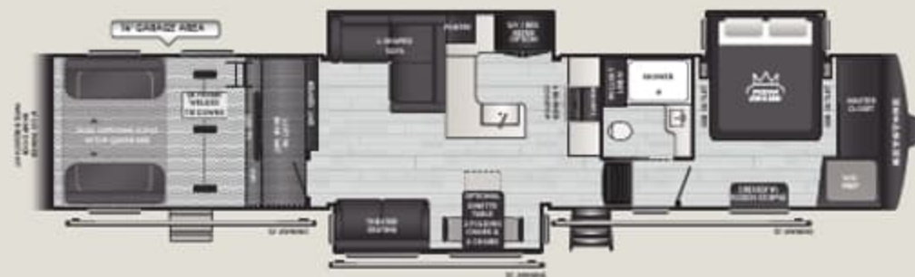
440 | WEIGHT 17110 | LENGTH 45' 11"