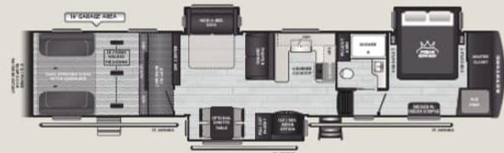
442 | WEIGHT 16900 | LENGTH 45' 2"