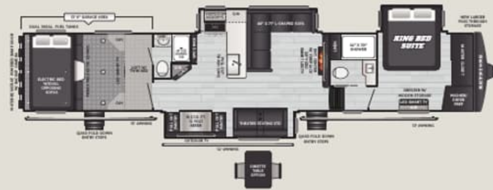
432 | WEIGHT 17615 | LENGTH 46' 1"