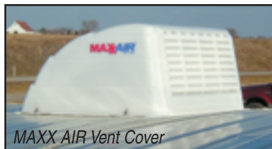
MAXX AIR Vent Cover