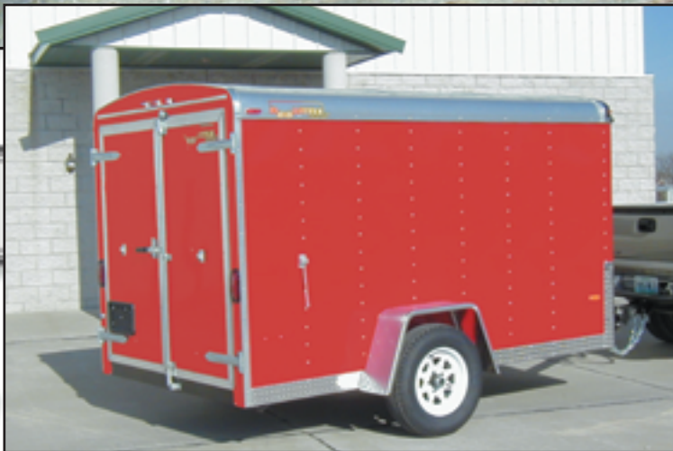
6'x12' S/A shown with stoneguard.