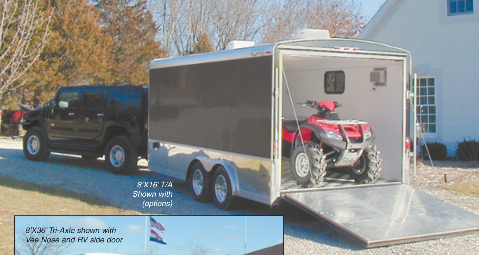
8'X16' T/A Shown with (options)