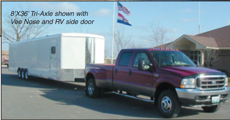
8'X36' Tri-Axle shown with Vee Nose and RV side door