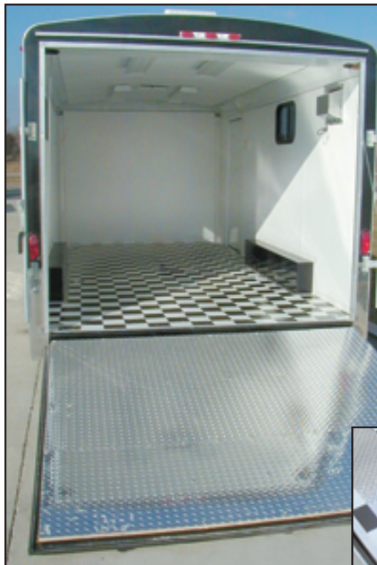
Fully undercoated, recessed 3/4" Sturdi-Floor provides one-level rear access for ease in loading