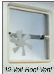
12 Volt Roof Vent