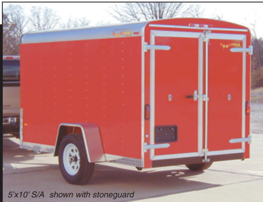
5'x10' S/A shown with stoneguard

All the Key Points above are included on all Doolittle Single Axle Cargo Trailers as standard equipment, at no extra cost.