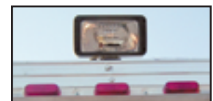
Rear Loading Light