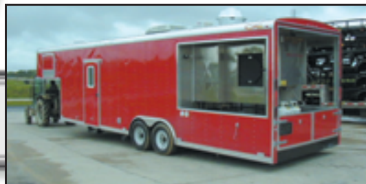
Concession Trailers Customized with rear mounted BBQ.

In addition to all the other fine features found on every Doolittle trailer, Gooseneck Trailers are easier to maneuver, offer better weight distribution, are gusseted for maximum strength, provide extra cargo space, and can be combined with many other options.