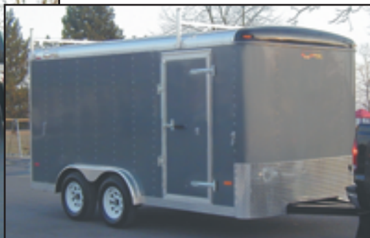
7'X12' T/A shown with side door, ladder racks and stoneguard.