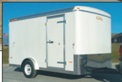
7'X12' S/A shown with side door and stoneguard.

Seven-Wide Transports Single and Tandem Axle Many other options available including GVW's up to 14,000 lbs.