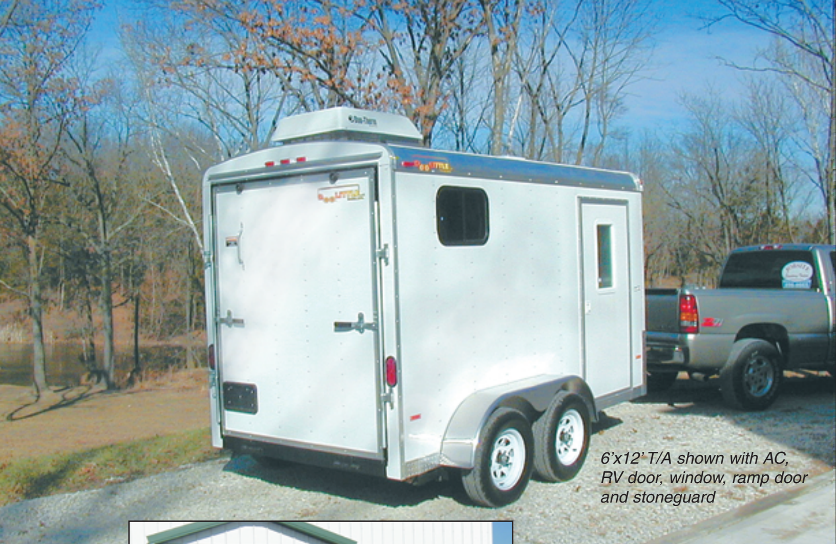
6'x12' T/A shown with AC, RV door, window, ramp door and stoneguard