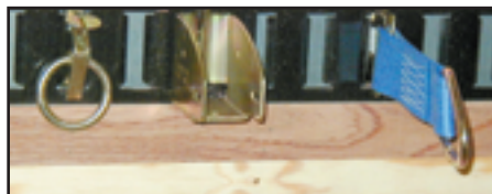
ETRAC with adjustable clips (wall or floor)