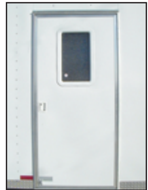
RV Door with Screens/Window Option