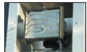
500 Watt Quartz Light