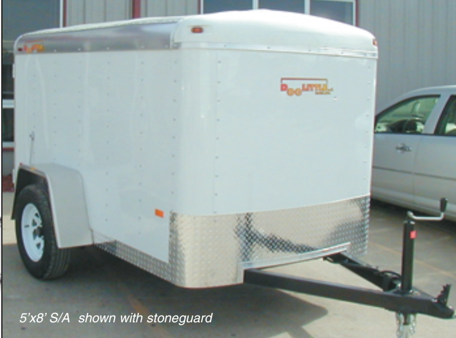
5'x8' S/A shown with stoneguard