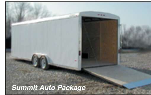
Summit Auto Package

"Living Quarters" packages Available with Beds, Kitchen, Lavatory and other comforts