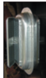
Popout Aluminum Vent