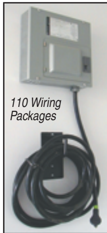
110 Wiring Packages