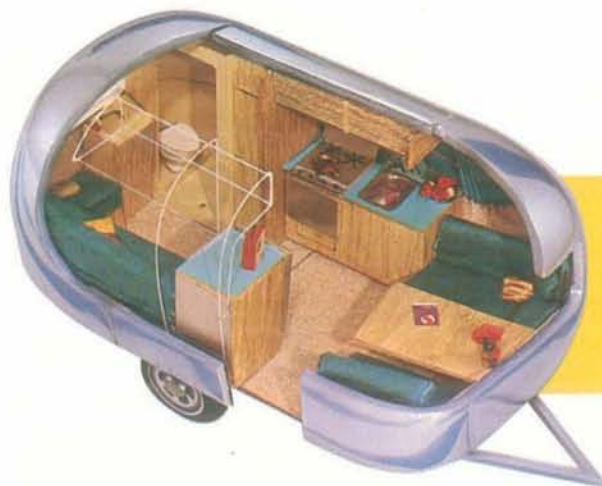
18 FT. CARAVEL (Special Land Yacht) Hitch Wt. 350 lbs. • Total Wt. 2880 lbs.

The International Land Yacht Series is available in the 27 foot Overlander, 29 foot Ambassador and 31 foot Sovereign of the Road. This series represents the ultimate in travel completeness and luxury. In addition to all of the basic equipment that is included in the Deluxe Land Yacht Series, this series includes: Two 7 gallon gas bottles; an automatic switch-over valve; central control panel (includes battery condition meter, ammeter, water pump indicator, water level gauge, holding tank gauge, battery operated clock, barometer and humidity-indicator); a large, adjustable no-draft translucent Astrodome vent; a Univolt ceiling exhaust fan; a Univolt range exhaust fan; two sink covers with cutting boards; deluxe plumbing hardware; water purifier; bedroom wall comfort cover; deluxe hub caps; and luxurious deep-pile, Herculon carpet in all areas including the bathroom.