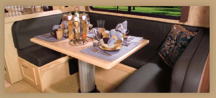
WEB BenchMark <sup>o</sup> The U-shaped dinette table in the 32H sits atop a single pedestal for more legroom. Both the U-shaped dinette and the BenchMark dinette (NA 38J) include a child safety-seat tether and convert into a comfortable bed.