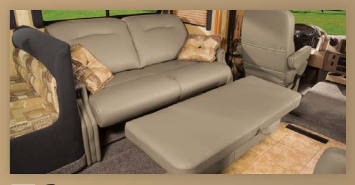
WEB Rest Easy <sup>*</sup> This multi-position lounge changes from a sofa to a recliner with ottoman to a comfortable bed, all at the touch of a button.