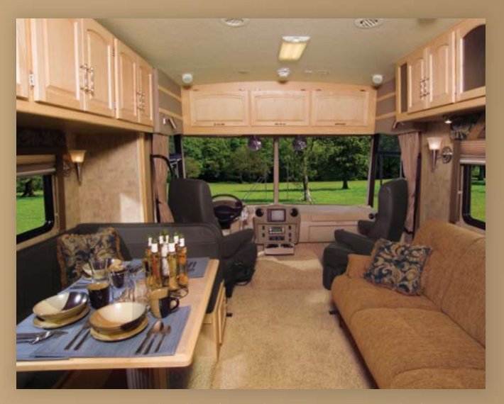
LIVING ROOM The abundant cabinetry comes in a sleek catalyzed finish typically reserved for upscale homes.

WEB titaniun TOUCH<sup>™</sup> The refrigerator features Titanium Touch<sup>™</sup> stainless finish doors, a Winnebago Industries exclusive, which has the look of stainless steel, resists fingerprints and is warmer to the touch than traditional stainless steel. As an added benefit, you can even use your favorite kitchen magnets.