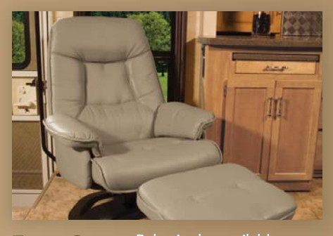
EURO CHAIR Relax in the available stylish UltraLeather recliner with ottoman (NA 32H).