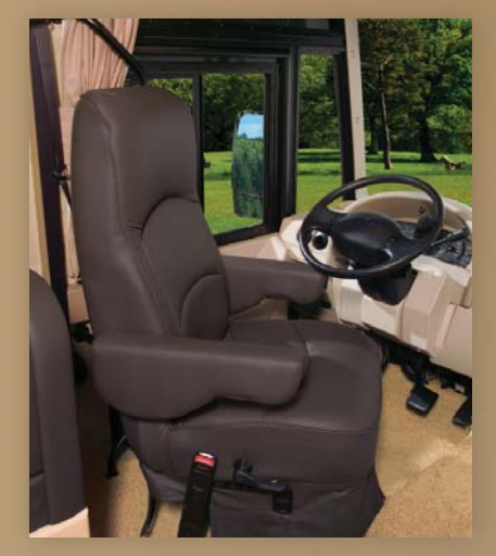
DRIVER'S SEAT The driver's seat is available in UltraLeather and with a six-way power assist pedestal for the ultimate in driving comfort.