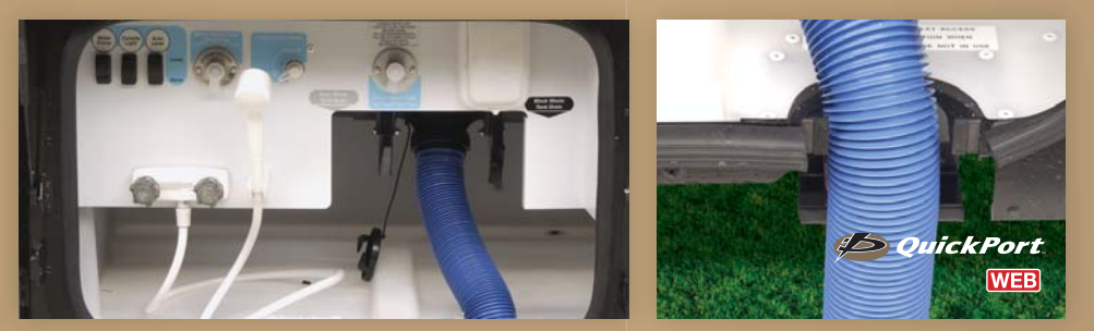
EXTERIOR SERVICE CENTER Large, color-coded labels make hookups a snap. The QuickPort<sup>®</sup> service connection hatch allows the bay doors to close when hookups are connected.