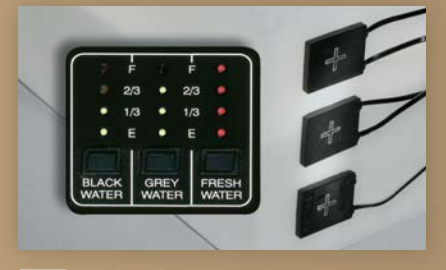
WEB TRUELEVEL Eliminate tank-level guesswork with our exclusive TrueLevel<sup>™</sup> holding tank monitoring system. It incorporates detector cells that determine liquid levels from outside the tank. No probes means no more corrosion, just accurate readings time after time.