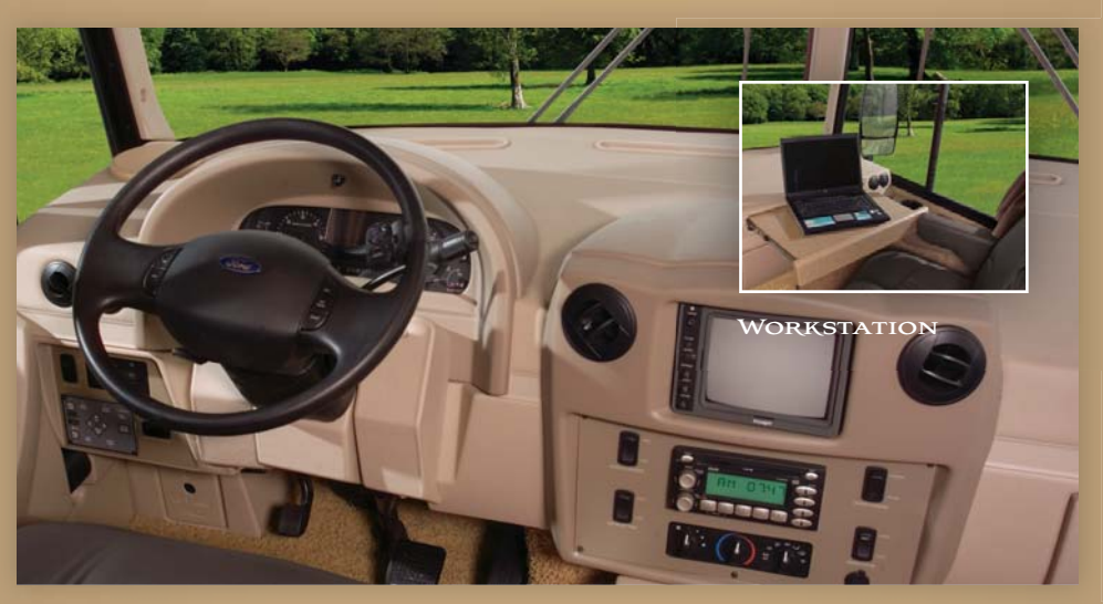
DASH The RV Radio with the Sirius Satellite package is iPod ready so you can listen to and charge your iPod while you drive. A dash workstation gives the passenger a place to set a laptop computer.

This energy management system monitors 110-volt electrical usage and automatically cycles appliances on and off to prevent power overloads. It's part of the OnePlace systems center that places switches and gauges in one convenient location.