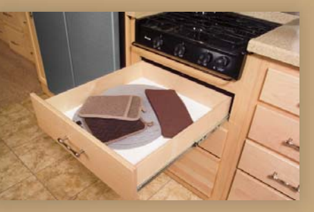
FULL-EXTENSION DRAWER SLIDES Drawers are sized to maximize storage, hold tight with positive latches and open fully for easy access to stored items.