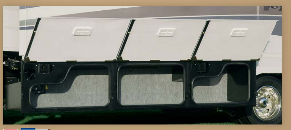
WEB STOREMORE This exclusive storage system allows exterior compartments to extend with the slideroom for easy access to stored gear (NA 32H).