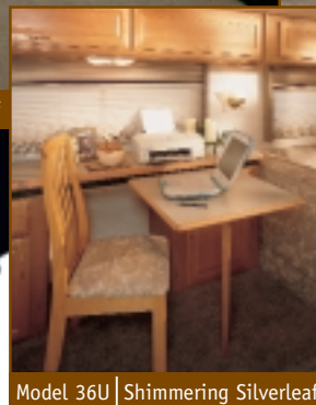
Model 36U | Shimmering Silverleaf

The optional workstation table in the new 36U floor plan easily slides side-to-side to create a desk for your personal computer. Stay in touch with family and friends by e-mail or maybe get a little business done in a great work environment—the outdoors.