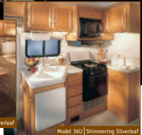
Model 36U | Shimmering Silverleaf

Take your gourmet kitchen wherever you travel. Spacious solid surface countertops are standard as well as the acrylic galley sink, a three-burner stove, microwave and an abundance of beautiful wood cabinetry shown with oak wood choice.