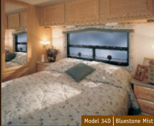
Model 34D | Bluestone Mist

Inviting and beautiful, the bedroom is decorated with coordinated fabrics, wood cabinetry, new decor lighting and day/night shades.