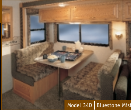
Model 34D | Bluestone Mist

Enjoy meals around Bouncer's roomy dinette, shown with oak wood choice, with plenty of cabinets and overhead storage.