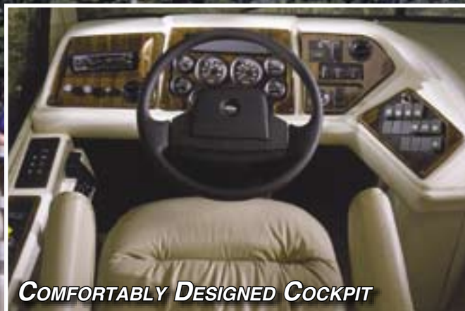
COMFORTABLY DESIGNED COCKPIT

The cockpit is ergonomically designed to bring the controls to your fingertips. Large easy to read gauges and luxurious seating will make your driving time more comfortable.