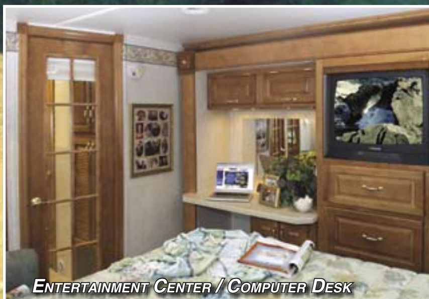
ENTERTAINMENT CENTER / COMPUTER DESK