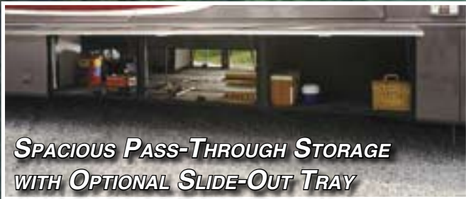
SPACIOUS PASS-THROUGH STORAGE WITH OPTIONAL SLIDE-OUT TRAY

There is plenty of exterior storage room for your travel needs. The Yellowstone's sub-floor features steel construction with a combination of tubular steel and strong steel trusses. The basement storage compartments are formed of galvanized steel for superior strength and durability. Most of them are carpeted to protect your belongings and lighted for easy loading and unloading at night.