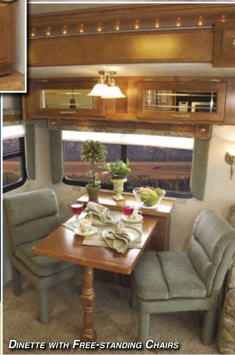
DINETTE WITH FREE-STANDING CHAIRS

Exclusive ceiling inset surround speakers