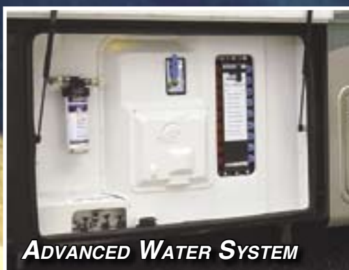
ADVANCED WATER SYSTEM

Our advanced water manifold system provides a main distribution point for all water system hook-ups. This includes appliances and shut-off valves, thereby minimizing potentially leaky fittings. The quick-response design also helps conserve water (40' only).