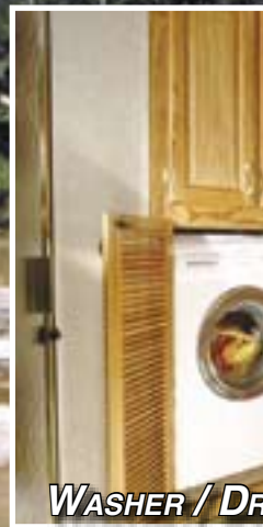
WASHER / DRYER