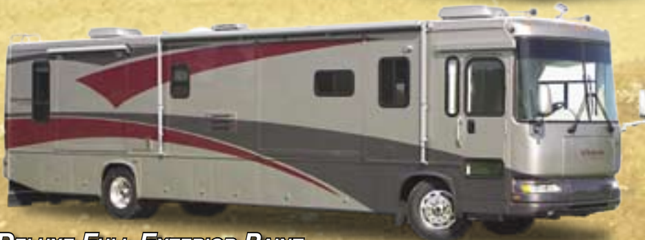
DELUXE FULL EXTERIOR PAINT