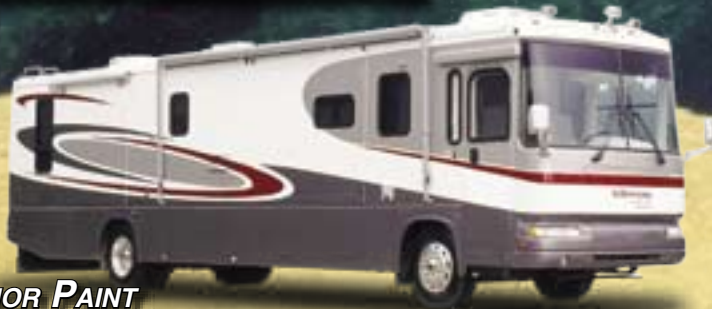
STANDARD EXTERIOR PAINT