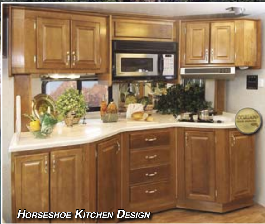
HORSESHOE KITCHEN DESIGN

Our residential style cabinets are constructed with solid hardwood stiles and doors. This brings both structural integrity and beauty to your living environment.