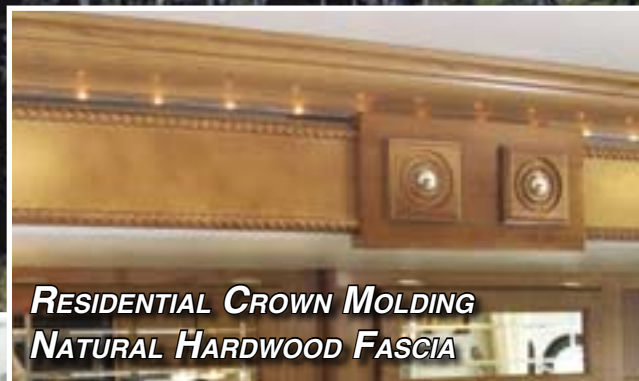
RESIDENTIAL CROWN MOLDING NATURAL HARDWOOD FASCIA

The Yellowstone provides you a pleasant driving experience. While traveling, you will enjoy the spacious panoramic view as you scan the countryside through the large open windshield.