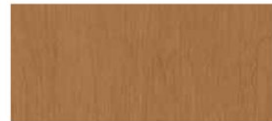
MOCHA GLAZED MAPLE