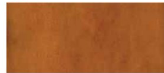
WASHINGTON GLAZED MAPLE