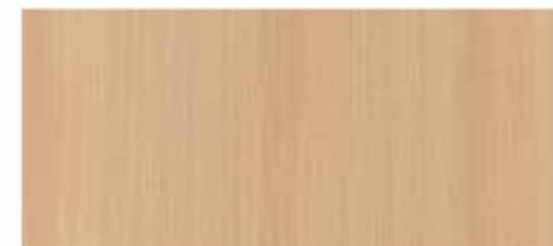
CARAMEL GLAZED MAPLE *

*Standard bathroom wood for 42DLQ and 42RBQ