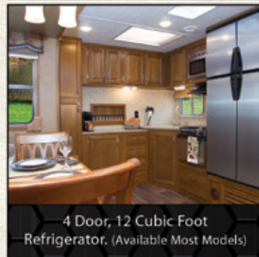
4 Door, 12 Cubic Foot Refrigerator, (Available Most Models)