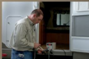
65 Point Secondary PDI