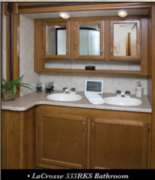
• LaCrosse 333RKS Bathroom