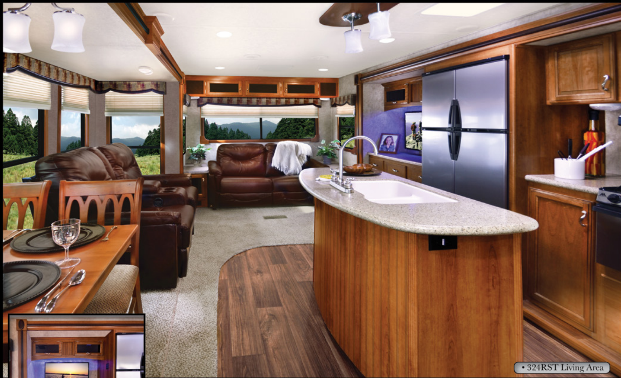
• 324RST Living Area