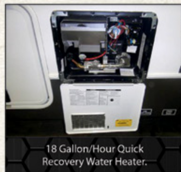
18 Gallon/Hour Quick Recovery Water Heater.