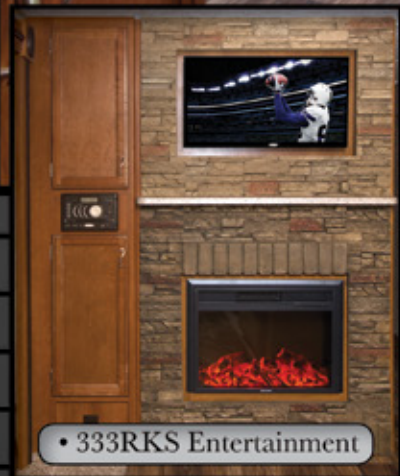
• 333RKS Entertainment

LUXURY TO THE MAX In the past, luxury and value were contradictory terms – not any more! LaCrosse redefines value to include the very best in price and quality but without sacrificing luxury, comfort, and convenience. LaCrosse is loaded with upgraded features like: LG Solid Surface Kitchen Countertops, beautiful Golden Cherry cabinet doors, and large LED TV's. To MAXimize your convenience, many floorplans offer an amazing 12 cubic foot refrigerator! The unmatched storage, residential appeal, and plush comfort of LaCrosse is normally reserved for units costing thousands more. Your search for the perfect combination of luxury and value is over. We have created it. It's called LaCrosse!