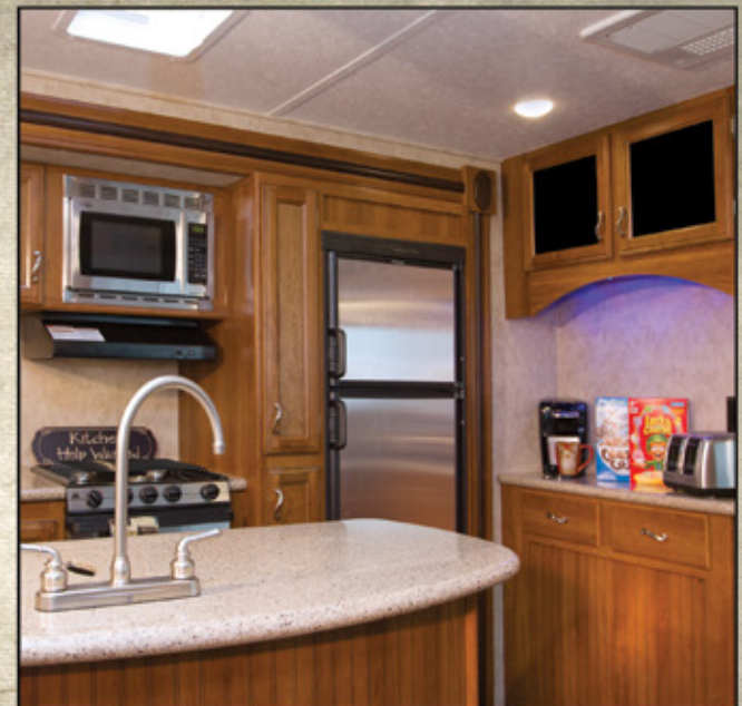
• LaCrosse 331BHT Kitchen