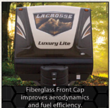
Fiberglass Front Cap improves aerodynamics and fuel efficiency.