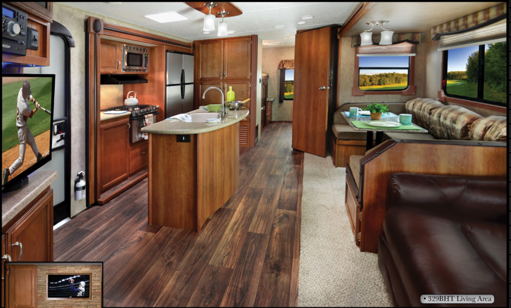
• 329BHT Living Area