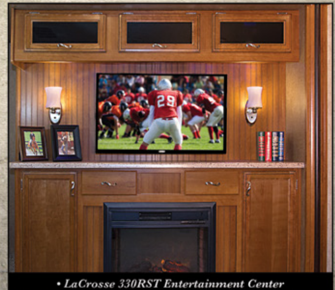
• LaCrosse 330RST Entertainment Center