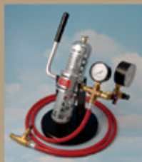
Seek-A-Leak Pressure Test