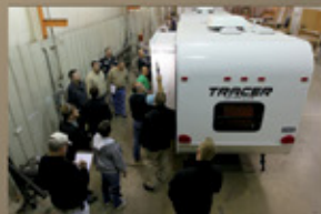
Executive Quality Audits