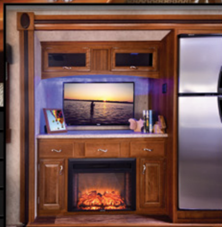
• 324RST Entertainment Center

LUXURY TO THE MAX With LaCrosse, this is more than just a catchy phrase found inside a brochure – it's the strategy that guides us every day as we strive to create the perfect Recreational Vehicle. A simple example of this strategy is LaCrosse's 82" sidewall height. Your senses will tell you that the extra headroom "feels" great. Then you notice that the kitchen cabinets are huge, vented windows are 20% larger – very nice, indeed. Finally, as you settle into the Residential Furniture, you will appreciate that LaCrosse has extra tall, very spacious slide-outs. Luxury To The Max. It's our strategy to MAXimize your enjoyment.