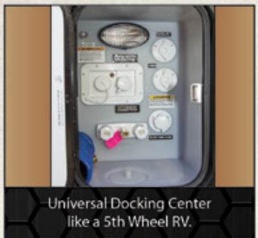
Universal Docking Center like a 5th Wheel RV.