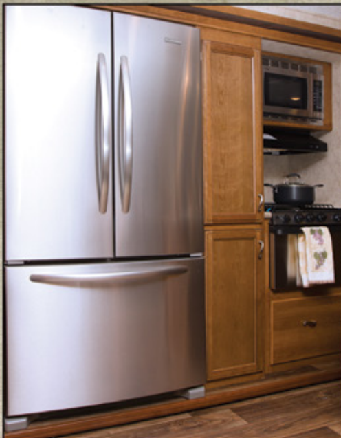
• LaCrosse 328RES Refrigerator and Pantry