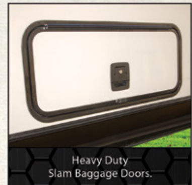
Heavy Duty Slam Baggage Doors.