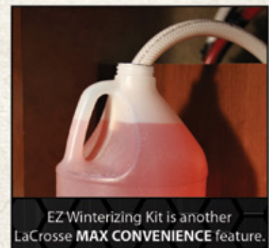
EZ Winterizing Kit is another LaCrosse MAX CONVENIENCE feature.