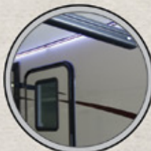
LED LIGHTED AWNING

*"See your local dealer for details on the availability of Touring Edition 5.0 package".