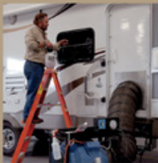
Seal Tech Air Pressure Test

Prime Time Manufacturing is proud to be recognized as an industry leader in value, reliability, and overall quality by the Recreational Vehicle Dealers Association. This was accomplished by committing ourselves to "A Higher Standard" in design, construction, testing, and customer service. Check us out - we know you'll be impressed!