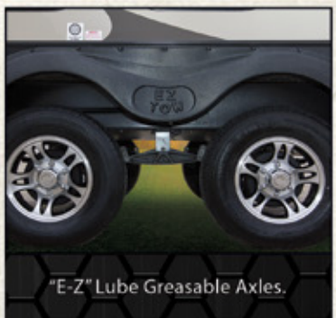
"E-Z" Lube Greasable Axles.