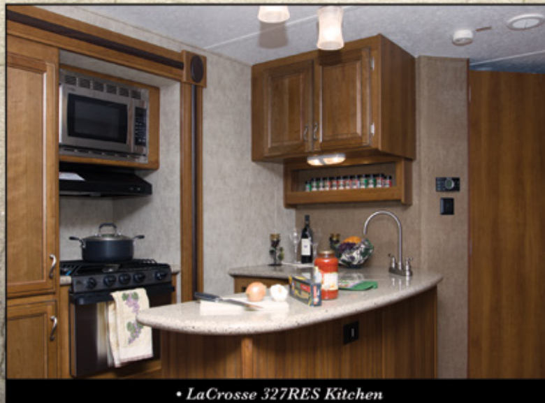
• LaCrosse 327RES Kitchen