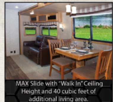
MAX Slide with "Walk In" Ceiling Height and 40 cubic feet of additional living area.