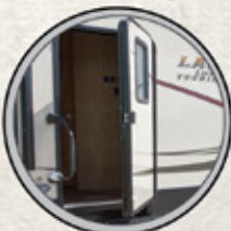
FRICITION HINGE DOOR