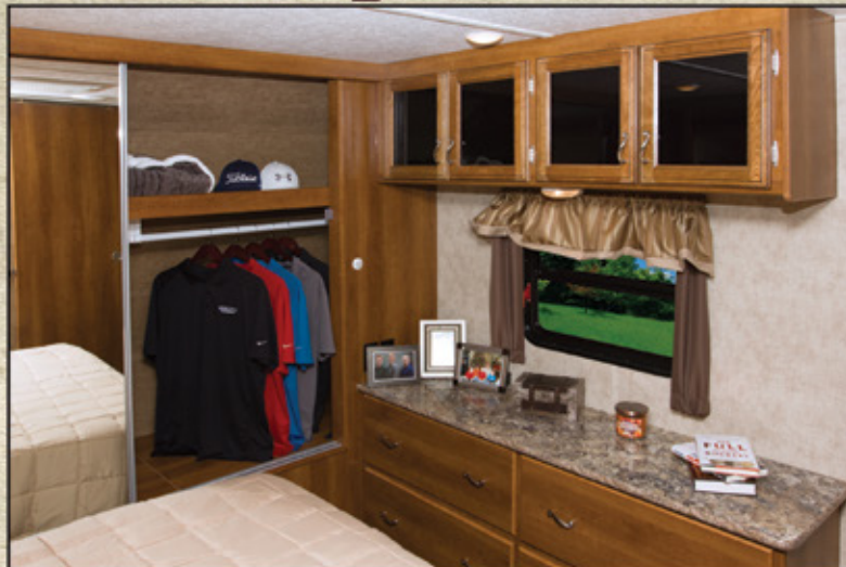
• LaCrosse 330RST Bedroom Wardrobe