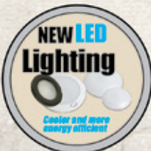
LED INTERIOR LIGHTING