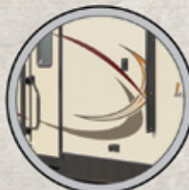
HIGH GLOSS FIBERGLASS