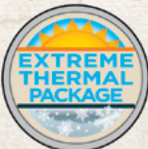
* R-52 EXTREME THERMAL PACKAGE