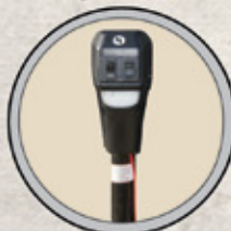
POWER TONGUE JACK