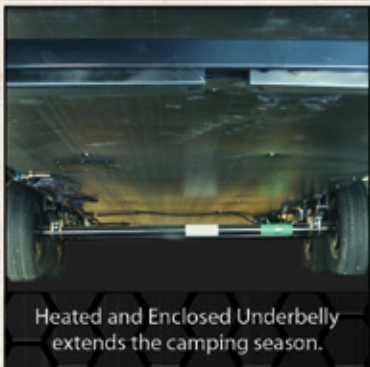
Heated and Enclosed Underbelly extends the camping season.