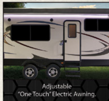
Adjustable "One Touch" Electric Awning.