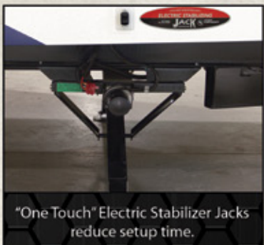
"One Touch" Electric Stabilizer Jacks reduce setup time.