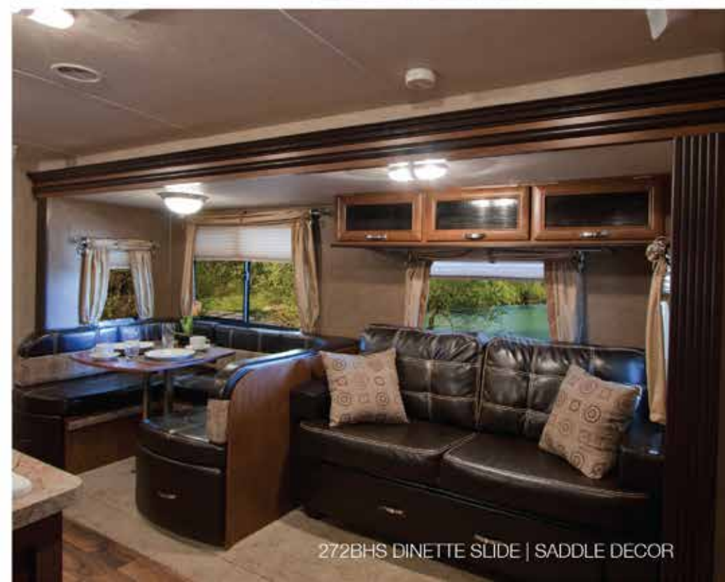
272BHS DINETTE SLIDE | SADDLE DECOR