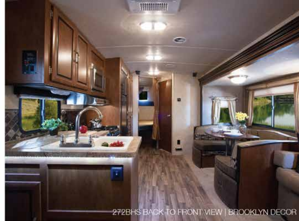
272BHS BACK TO FRONT VIEW | BROOKLYN DECOR