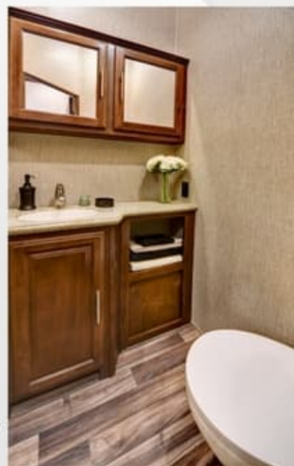
37DB Half Bath