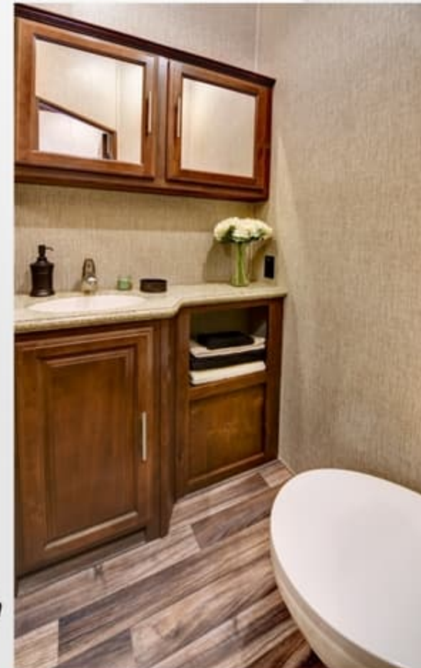
37DB Half Bath