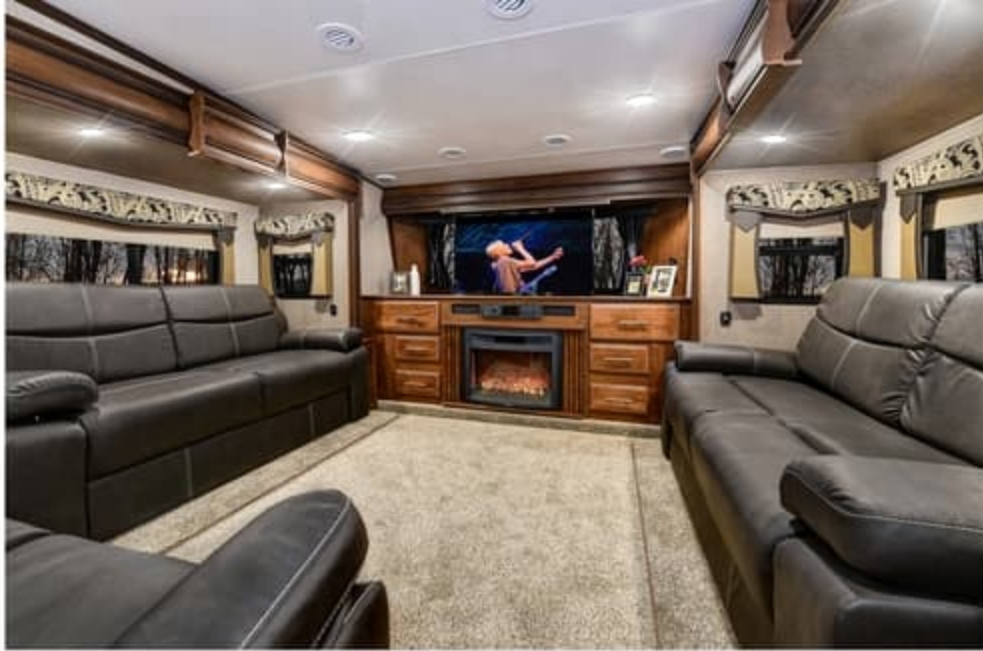
38FL Front Living Area w/ Panoramic Windshield & Retractable TV

Cameo transfers its elegant and prestigious exterior to the interior as well.