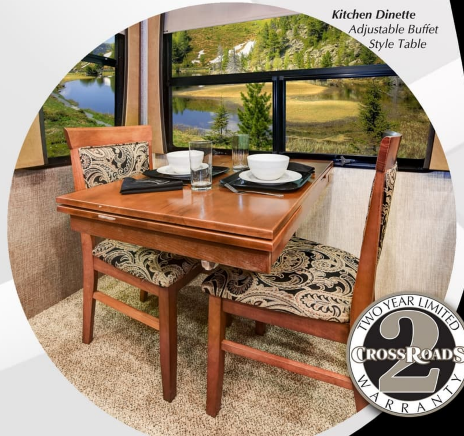
Kitchen Dinette Adjustable Buffet Style Table