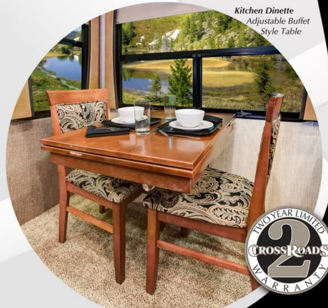
Kitchen Dinette Adjustable Buffet Style Table