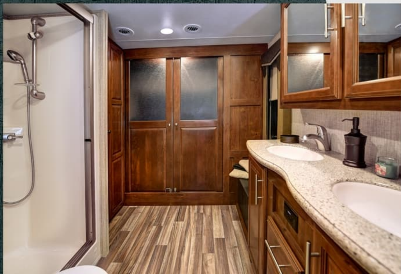
37DB Bathroom His & Hers Sinks w/ Laundry Hamper