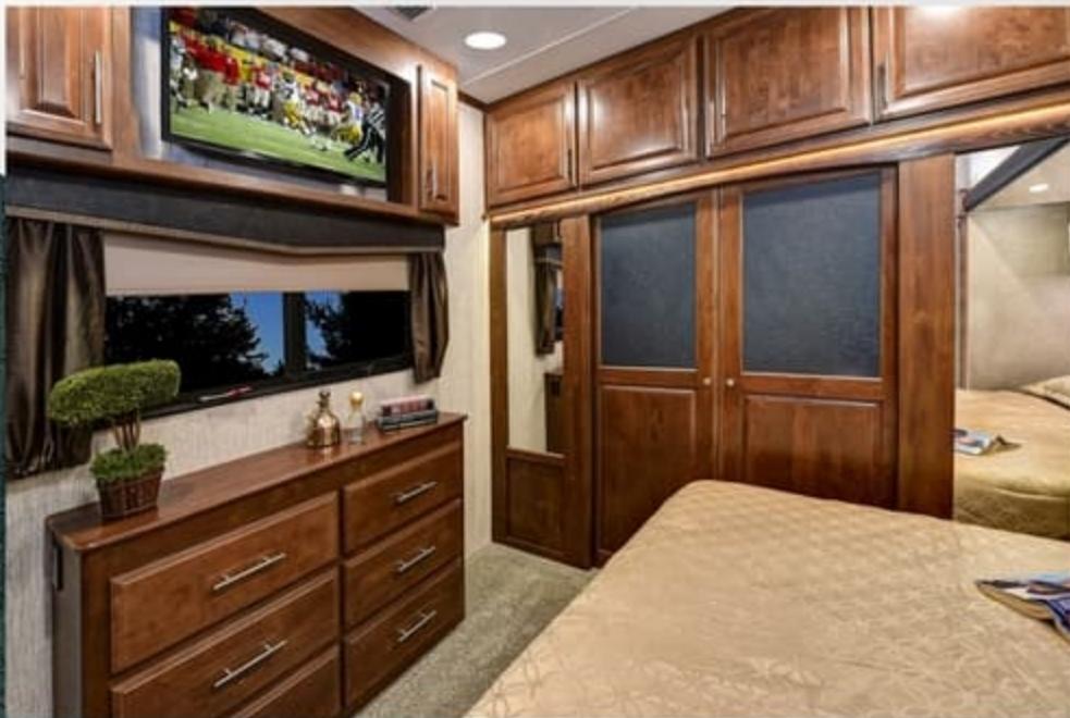
38FL Bedroom Taller Ceilings, Built In LED Nightlight & Additional 20% Over Head Storage