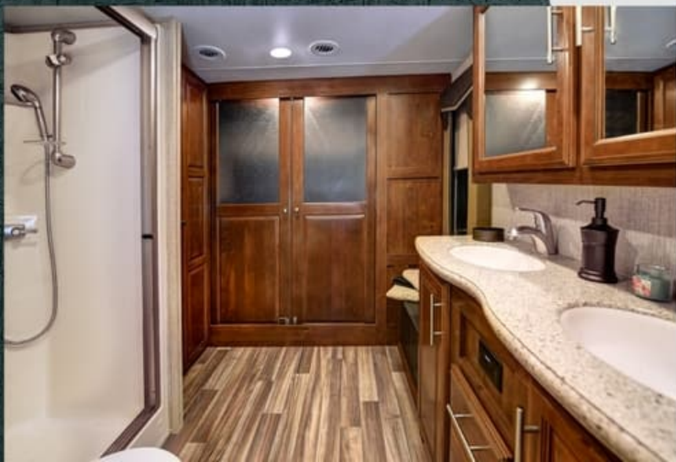
37DB Bathroom His & Hers Sinks w/ Laundry Hamper