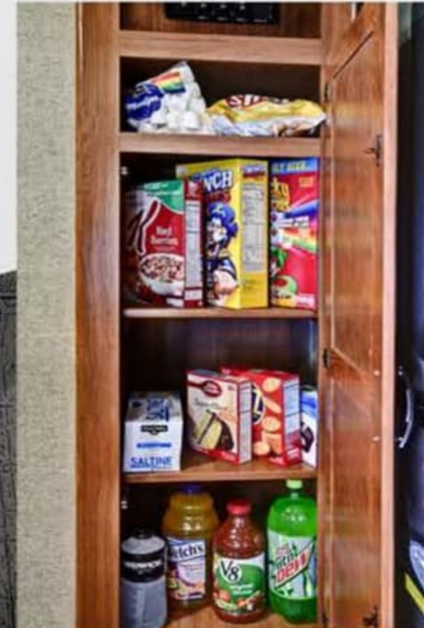
320BH Entryway Storage used as pantry