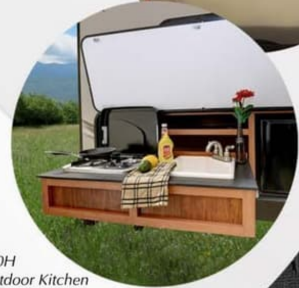
270H Outdoor Kitchen