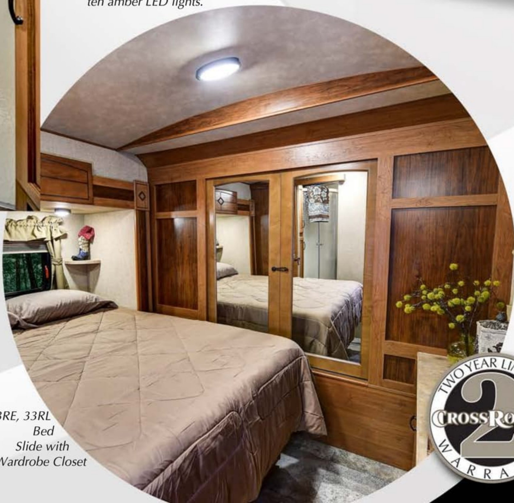
29RL, 33RE, 33RL Bed Slide with Wardrobe Closet

Our exterior features a UV protected front cap that eliminates fading and stands out in a crowd with ten amber LED lights.