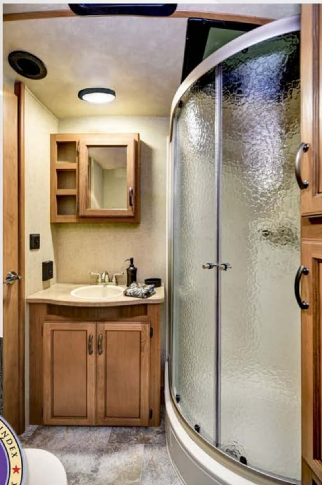
29RL Bath 33RE 33RL

The Grand Reserve boasts solid surface counter tops, stainless steel sinks, an I-Cool Residential Mattress and a porcelain foot flush toilet.