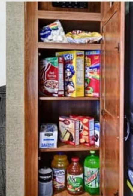
320BH Entryway Storage used as pantry