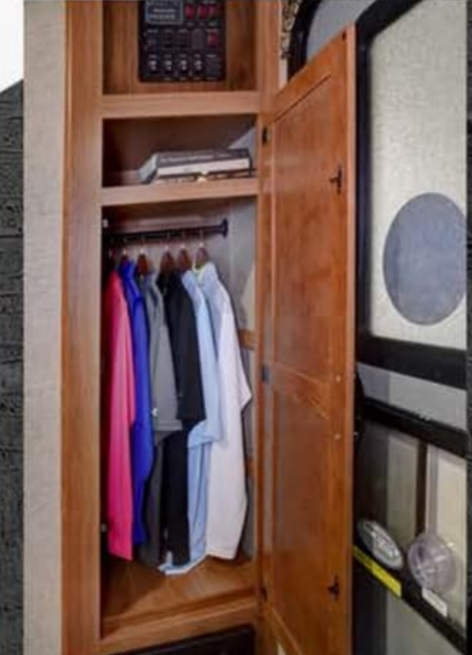
320BH Entryway storage used as closet space

*All Pantries include a hanging rod and adjustable shelving.