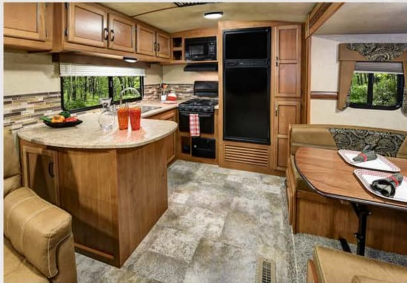
300RK Kitchen & Dinette Booth