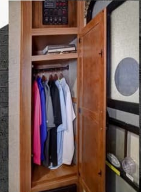
320BH Entryway storage used as closet space

*All Pantries include a hanging rod and adjustable shelving.