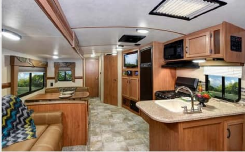
260RL Kitchen and Dinette Booth