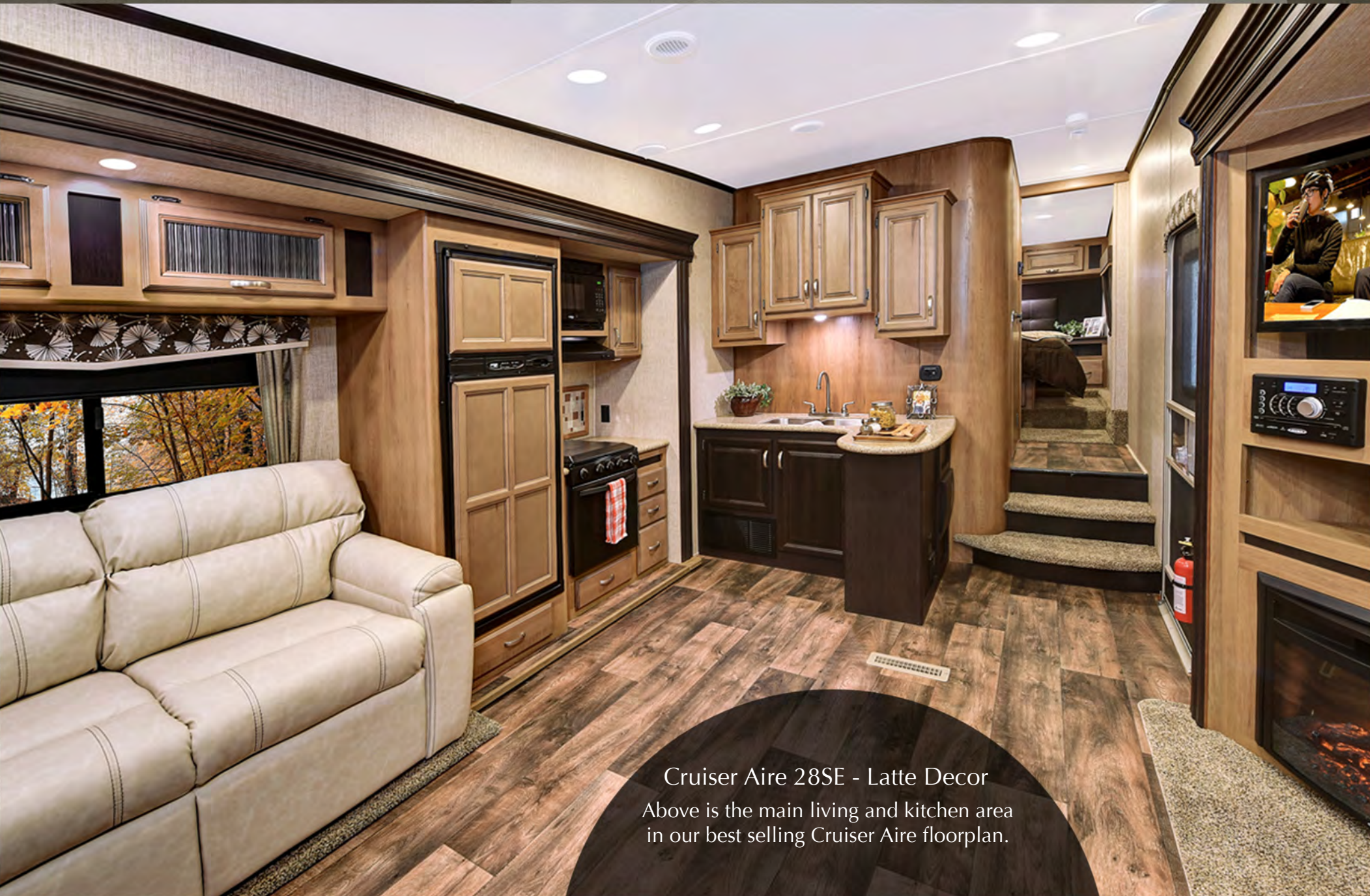
Cruiser Aire 28SE - Latte Decor Above is the main living and kitchen area in our best selling Cruiser Aire floorplan.