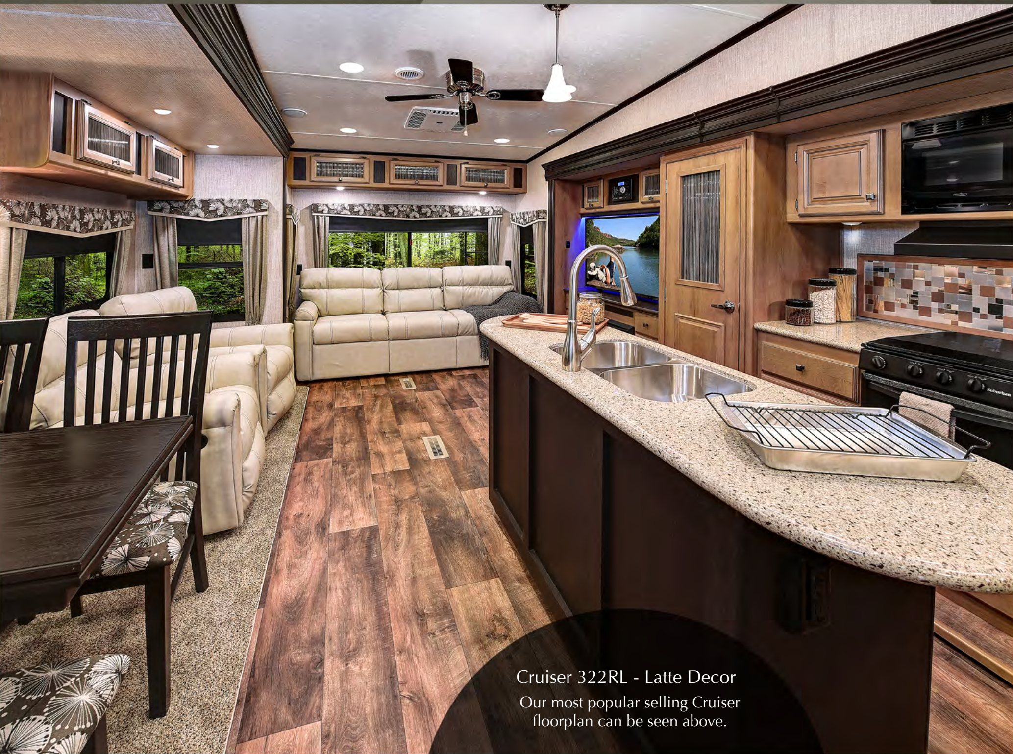
Cruiser 322RL - Latte Decor Our most popular selling Cruiser floorplan can be seen above.