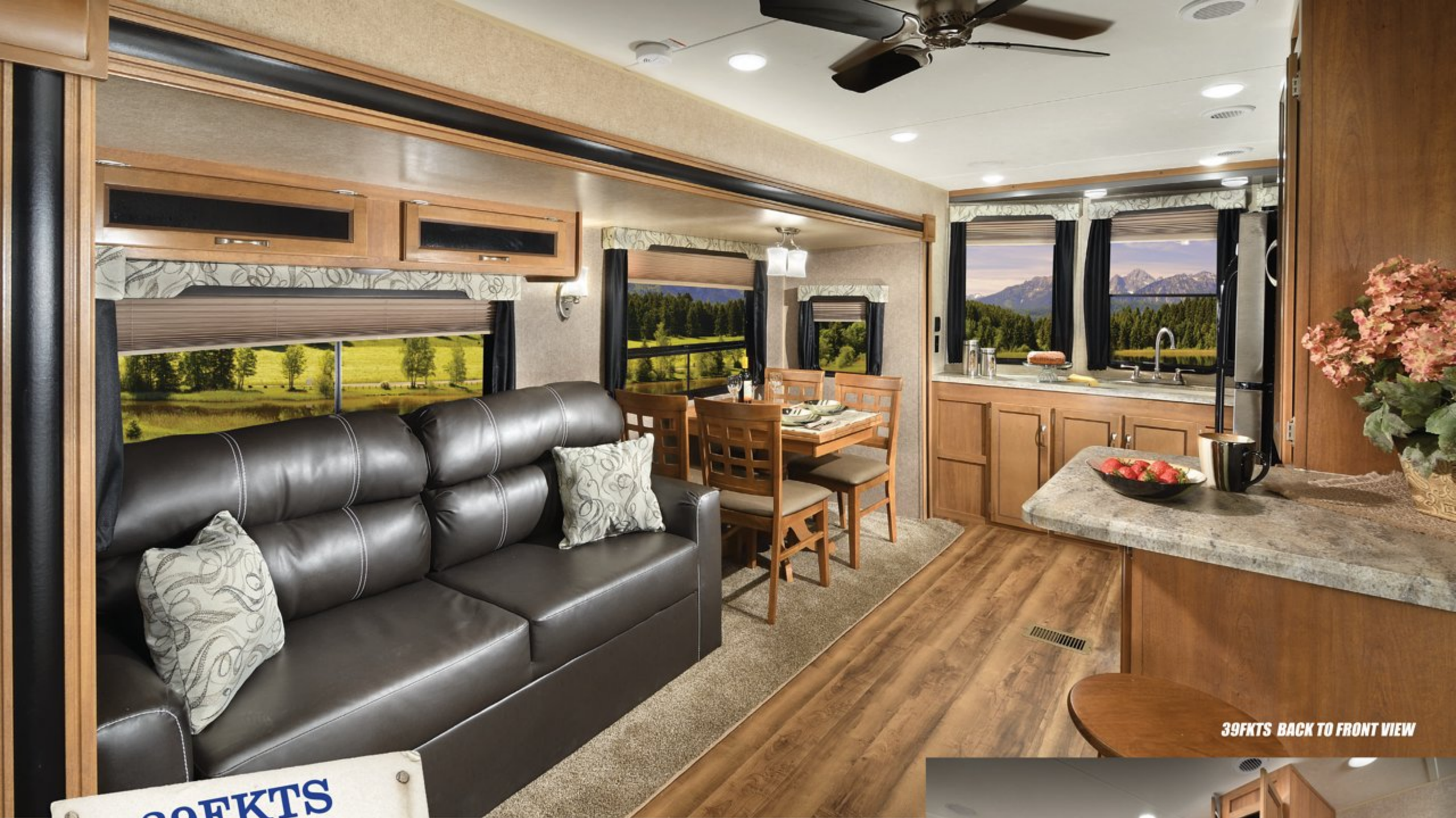
39FKTS BACK TO FRONT VIEW