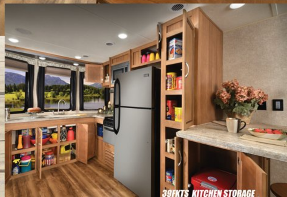
39FKTS KITCHEN STORAGE