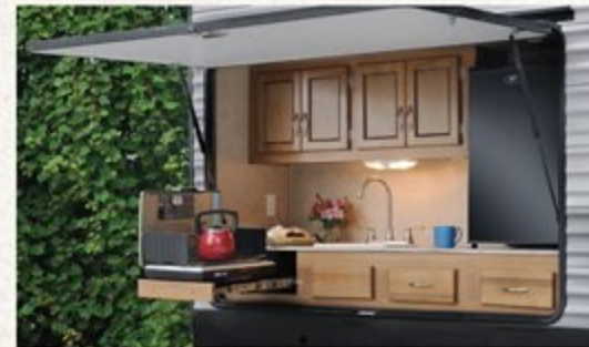
40BHTS OPTIONAL CAMP KITCHEN