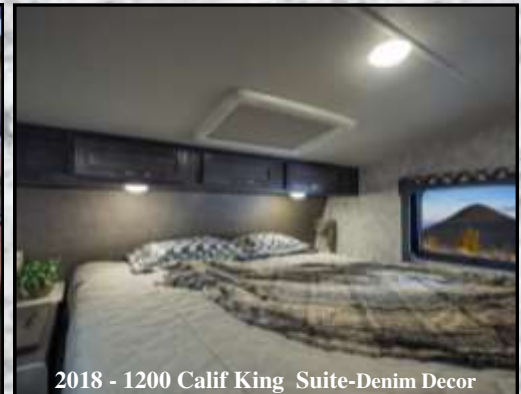
2018 - 1200 Calif King Suite-Denim Decor

The 1160/1165 Eagle Cap has a Secluded Bedroom Suite with dual bedroom windows for cross ventilation and it includes a double door wardrobe for plenty of hanging and storage... Luxury Bedrooms - built like none other!