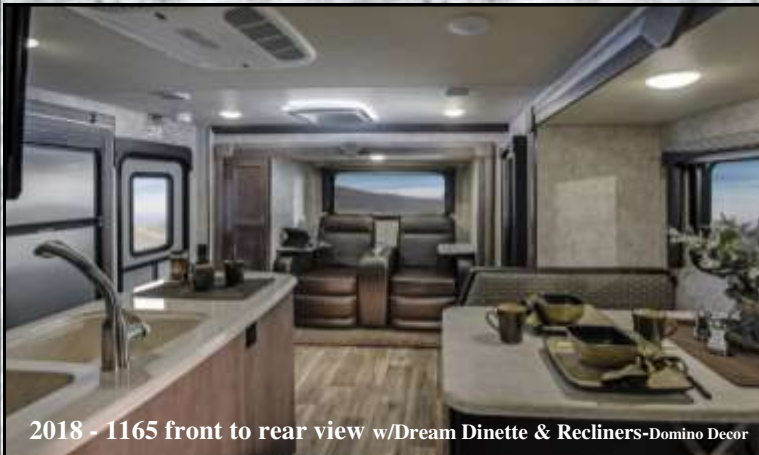
2018 - 1165 front to rear view w/Dream Dinette & Recliners-Domino Decor

Top Right - 1200 Rear to Front View. Notice the extremely large open space in this largest in the Industry 12' Truck camper. Note the dual access to the California King (72"x 84") Bedroom Suite. Also note the optional 32" Living room TV and the Theater Seating Recliners shown here with the all new Swing Away Tables in Denim Décor ...