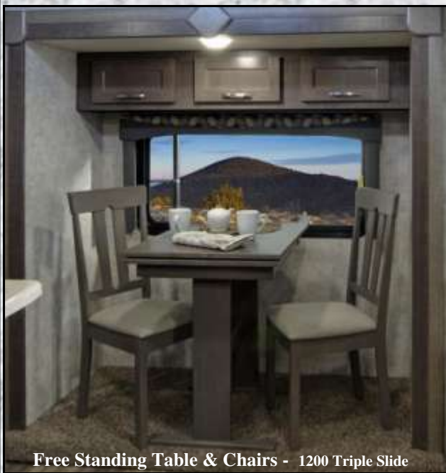
Free Standing Table & Chairs - 1200 Triple Slide

This Eagle Cap exclusive was born out of our collaboration with large 5th wheel and motorhome customers/owners looking for those high end luxury amenities. They found them in Eagle Cap.