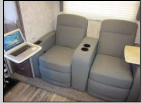
2018 Theater Seating - w/Swing-Away Tables - Denim Decor