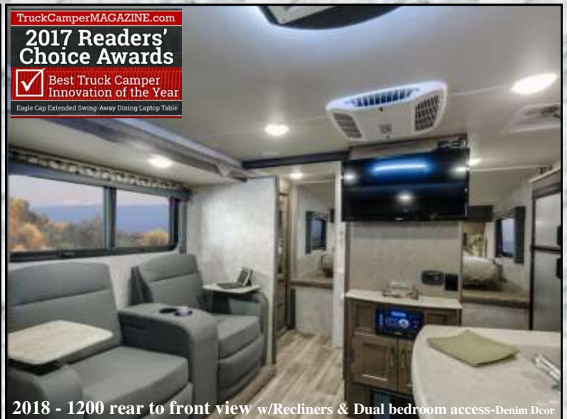
2018 - 1200 rear to front view w/Recliners & Dual bedroom access-Denim Decor