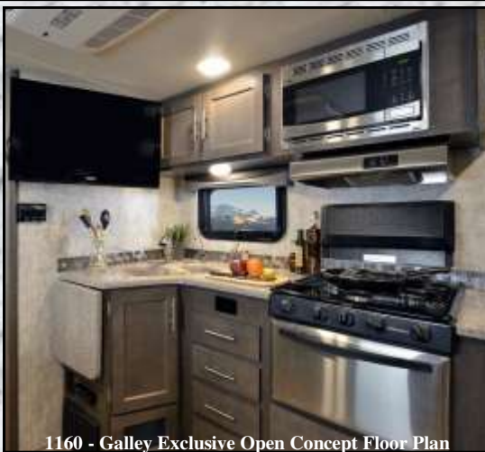
1160 - Galley Exclusive Open Concept Floor Plan

The Eagle Cap 1160 Double Slide enjoys a large galley with abundant overhead cabinet storage and plenty of counter space. The Stainless Steel Appliances really accent this open concept living, dining and Galley floorplan... This model gives you the largest floor space in a truck camper!