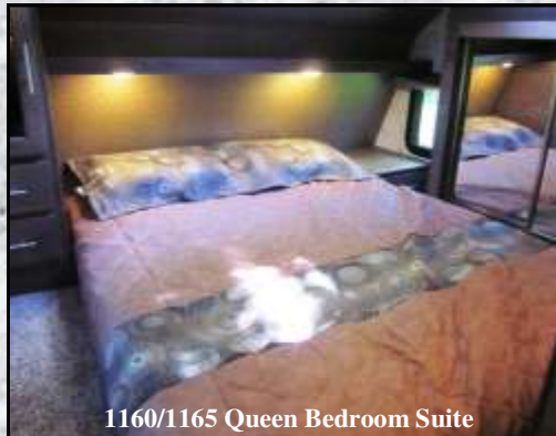
1160/1165 Queen Bedroom Suite

The 811 Eagle Cap has a roomy luxurious Queen Bedroom Suite with dual bedroom windows for that cool cross ventilation, dual door wardrobe and an ALP exclusive Camper Caddy Storage system... Best Truck Camper - built like none other!