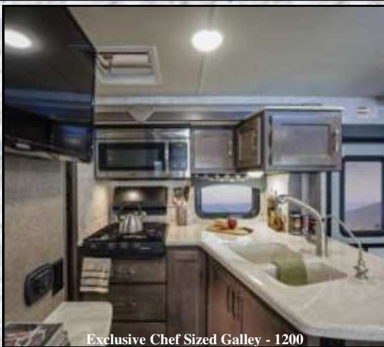
Exclusive Chef Sized Galley - 1200

Eagle Cap Luxury not seen in the industry!