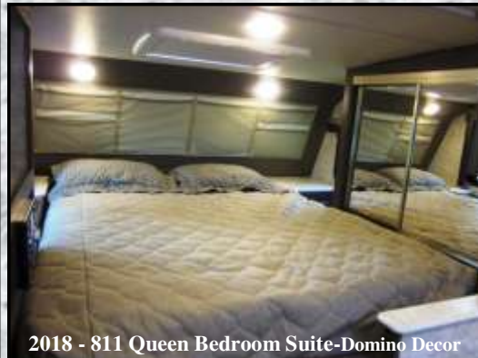
2018 - 811 Queen Bedroom Suite-Domino Decor

The 811 Eagle Cap has a roomy luxurious Queen Bedroom Suite with dual bedroom windows for that cool cross ventilation, dual door wardrobe and an ALP exclusive Camper Caddy Storage system... Best Truck Camper - built like none other!