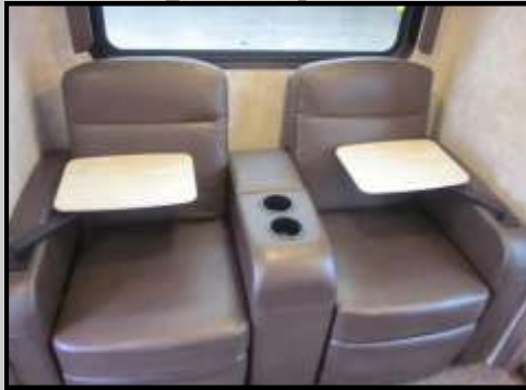
2018 Theater Seating - w/Swing-Away Tables - Domino Decor