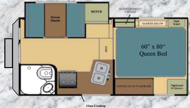
811 Fits SB and LB Trucks (6' to 8' even w/Generator)