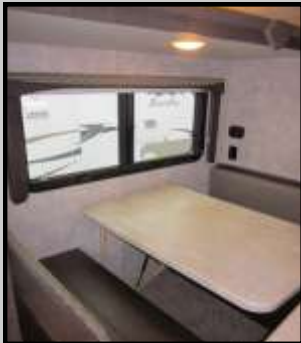
2018 Dream Dinette / Bed - Domino Decor