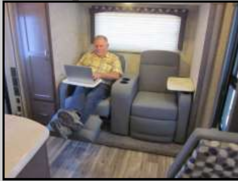
2018 Theater Seating - w/Swing-Away Tables - Denim Decor