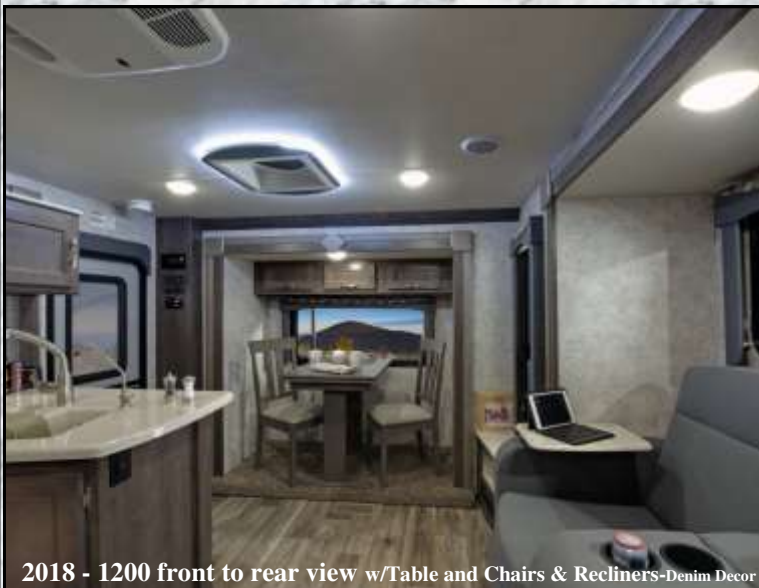
2018 - 1200 front to rear view w/Table and Chairs & Recliners-Denim Decor