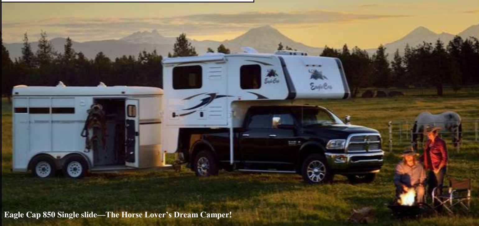
Eagle Cap 850 Single slide—The Horse Lover's Dream Camper!