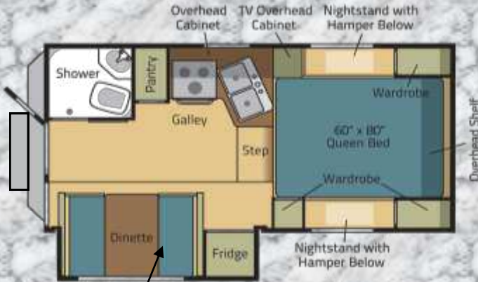
850 Fits SB and LB Trucks (6' to 8' - (Fits SB only w/Generator)