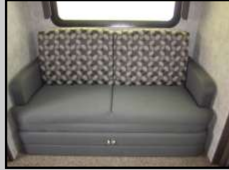
2018 Sofa / Bed w/storage drawer - Denim Decor