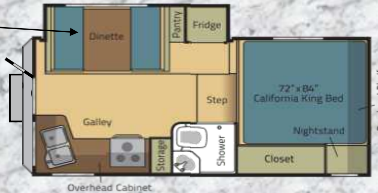
960 Fits LB Trucks (8') only