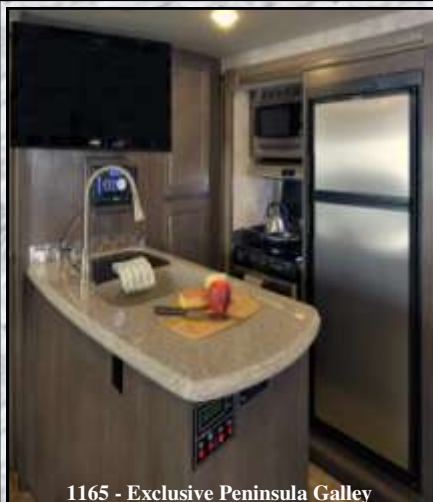
1165 - Exclusive Peninsula Galley