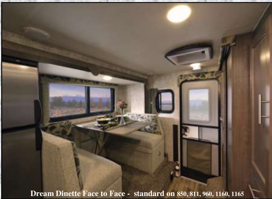
Dream Dinette Face to Face - standard on 850, 811, 960, 1160, 1165

Eagle Cap features the standard Dream Dinette where you don't have that annoying table leg in your way, giving you more foot room in your dinette. The best part about this dinette is with the flip of a lever the table simply presses down to make into a bed without having to remove the whole table, to restore it back to a dinette you simply pull the gas propped table up and lock the lever!