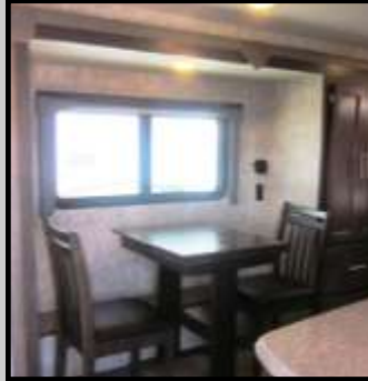
Free Standing Table & Chairs