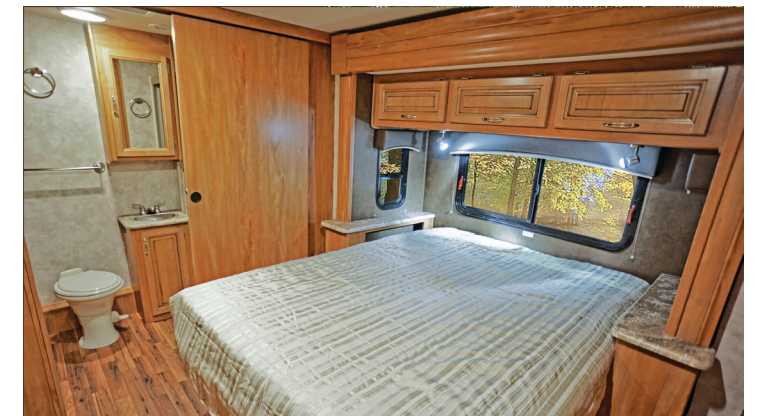
Spacious 37M master bedroom suite with optional washer/dryer and private bathroom shown with glazed maple hardwood cabinets.