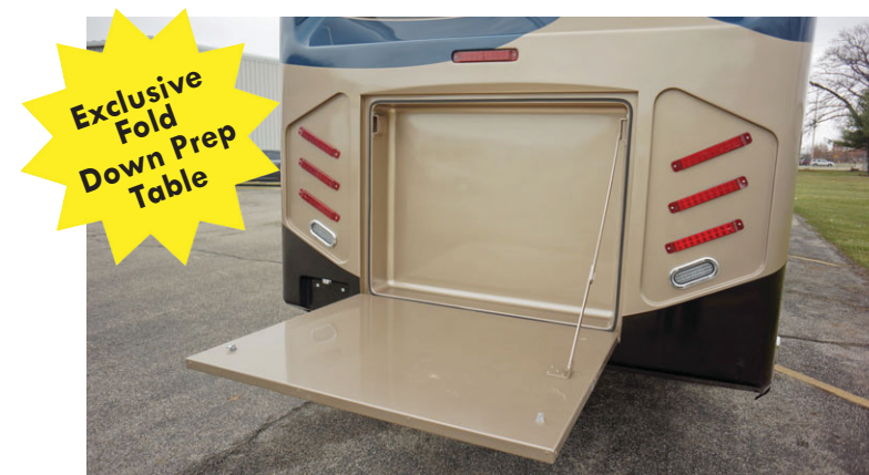
Premolded rear fiberglass cap with exclusive fold down prep table and LED lighting.