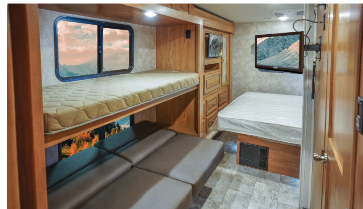
37M Bunk beds with jack-knife sofa shown in glazed maple cabinets (or wardrobe option available.)