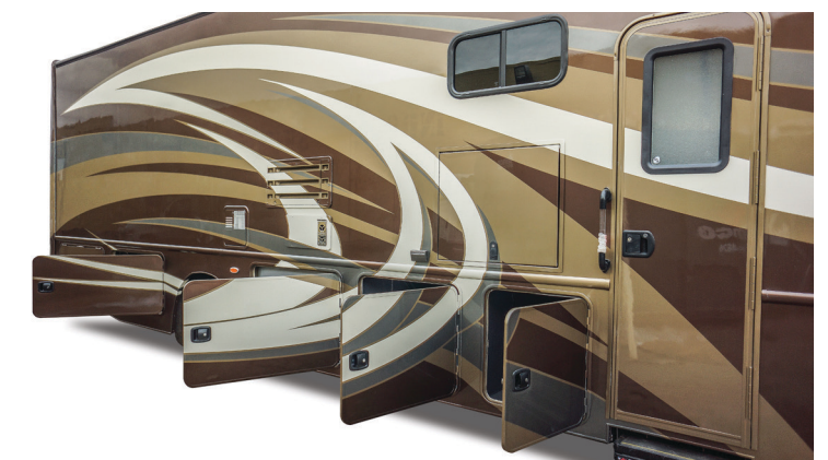
Full pass through basement storage with galvanized steel compartments and heated holding tanks.

Refer to our website ( www.NeXusRV.com ) for more standard and optional specifications.