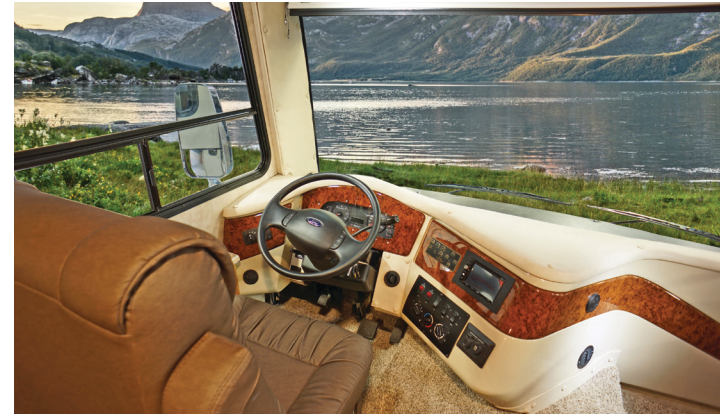
Best ergonomically designed cockpit with dual screen, wrap around dash and luxurious driver/passenger seats.

The Maybach offers luxury design at great savings. Fully equipped, it has a large windshield for maximum view, and allows the driver and passenger seats to be turned around to act as part of the living quarters.