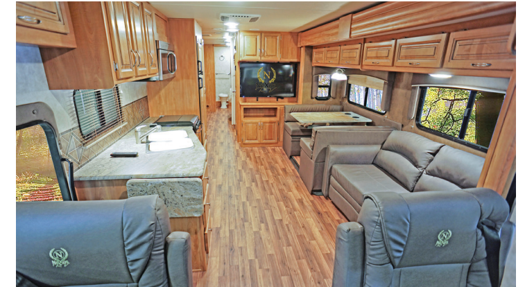
Super slide living room with large kitchen shown with glazed maple hardwood cabinets.