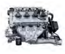
1,812cc High Output (HO)