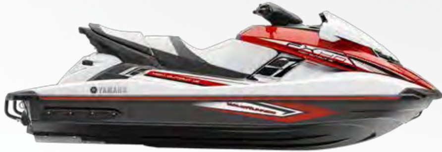
Pure White with Torch Red Metallic