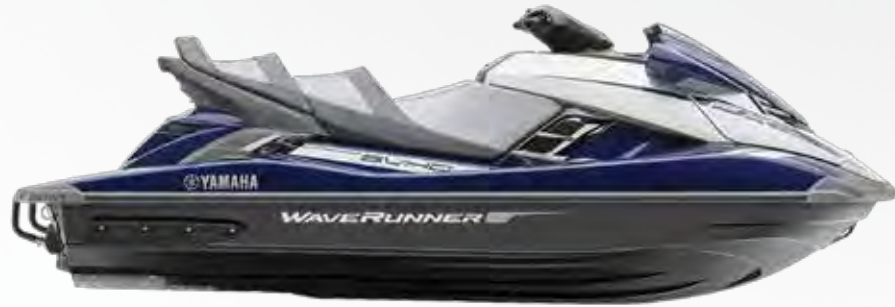
Yacht Blue Metallic