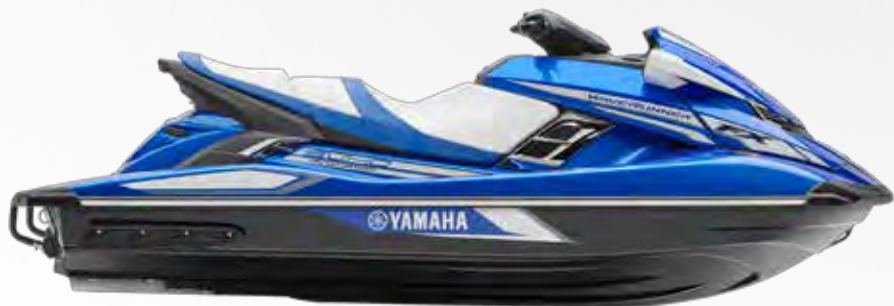
Azure Blue Metallic