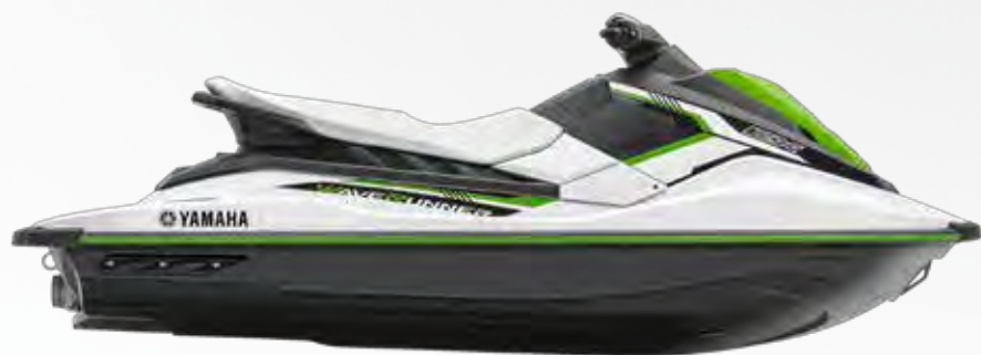
Pure White with Green