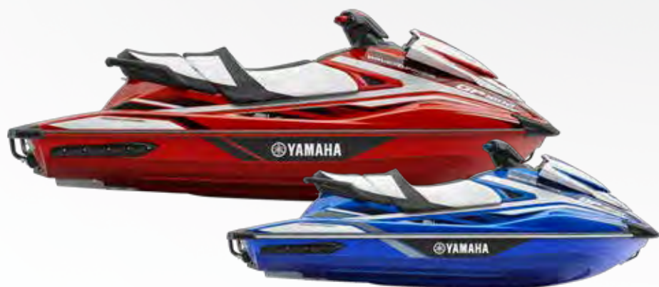
Torch Red Metallic / Azure Blue Metallic