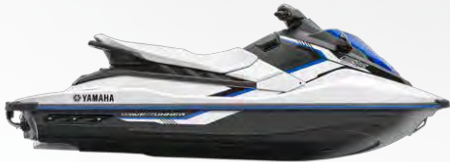
Pure White with Azure Blue