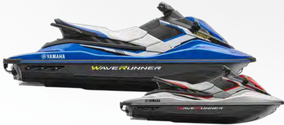
Azure Blue Metallic / Silver Metallic with Torch Red Metallic