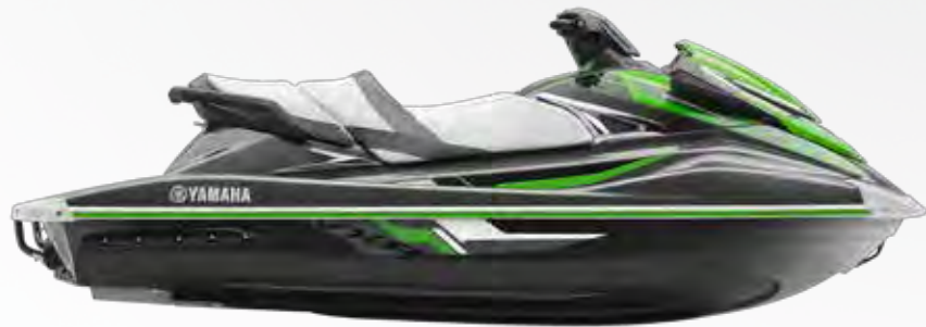
Carbon Metallic with Electric Green