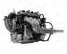
1,812cc Super Vortex High Output (SVHO)