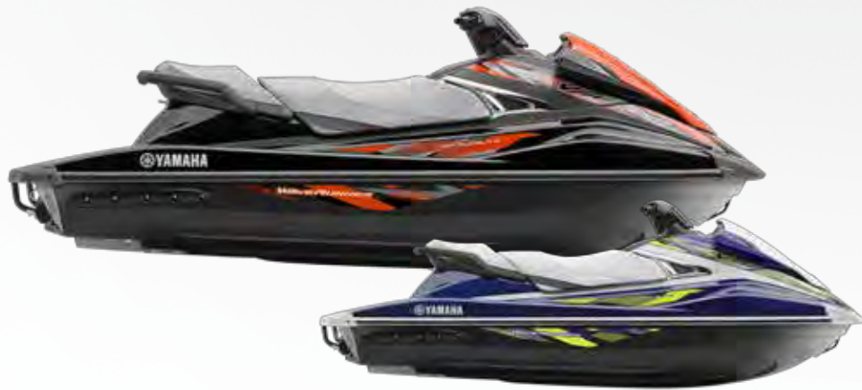
Black Metallic with Lava / Yacht Blue Metallic