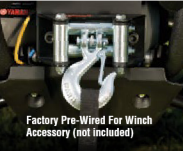
Factory Pre-Wired For Winch Accessory (not included)