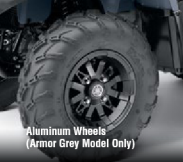
Aluminum Wheels (Armor Grey Model Only)