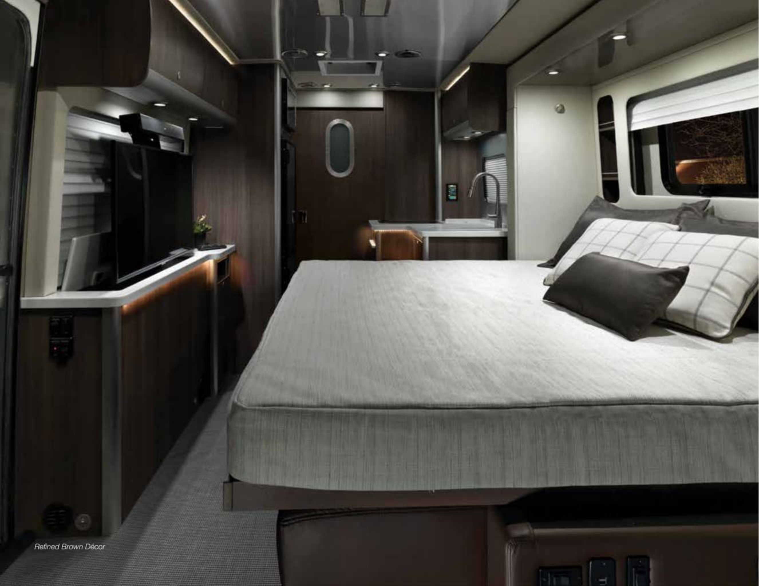
Refined Brown Décor