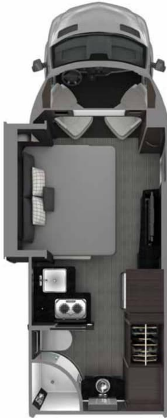
Atlas Sleeping Quarters