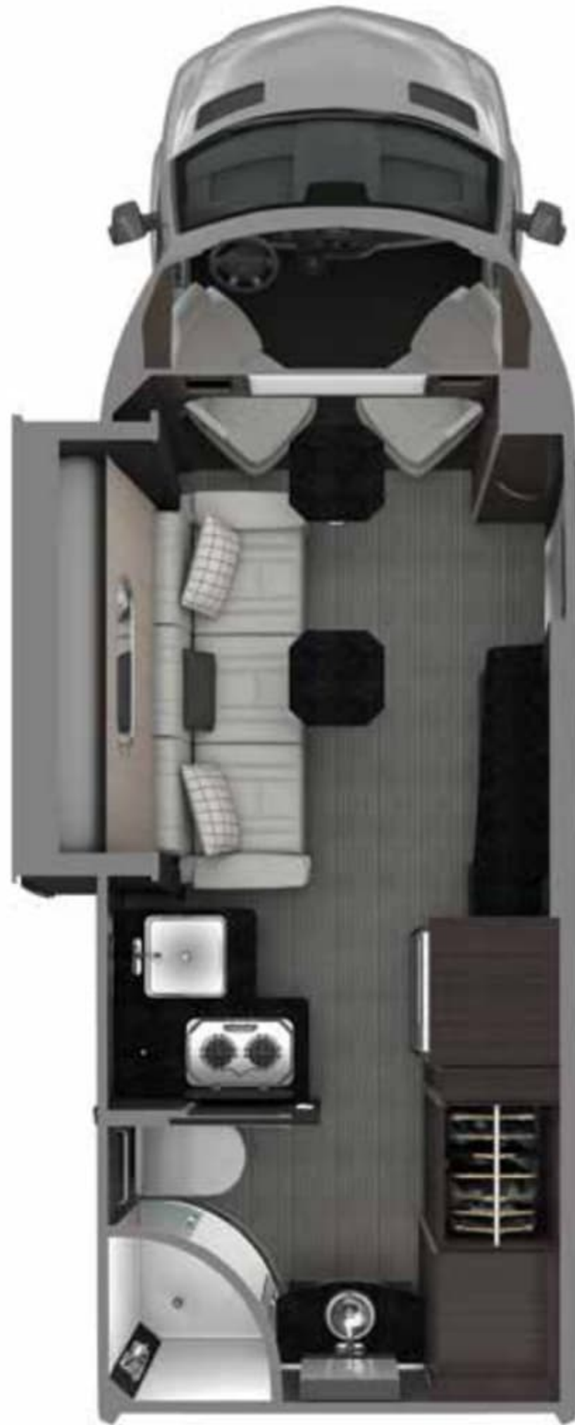
Atlas Lounge Slide-Out