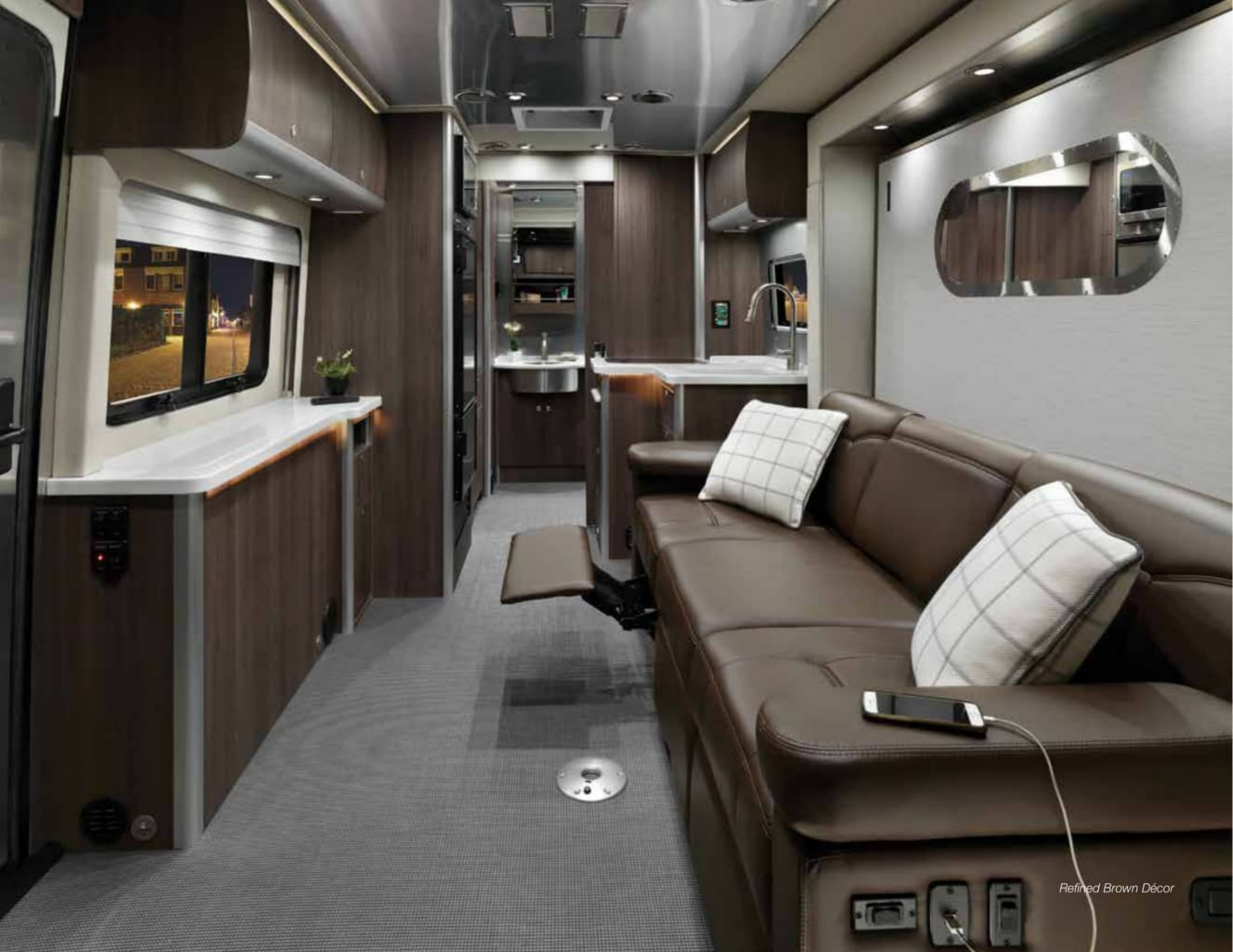
Refined Brown Décor