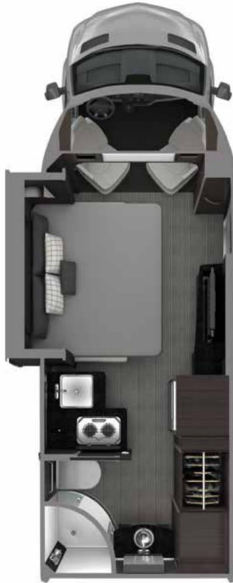
Atlas Sleeping Quarters