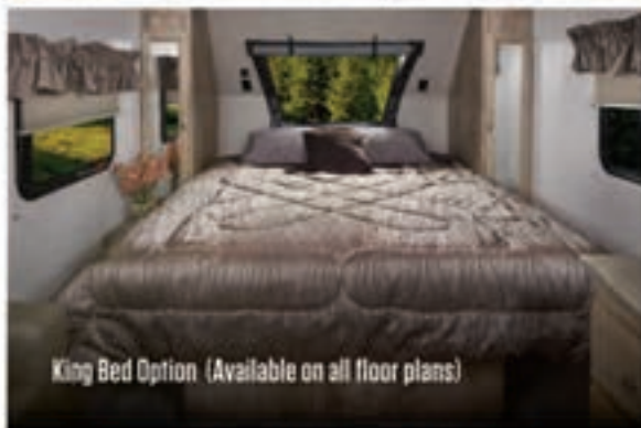
King Bed Option (Available on all floor plans)