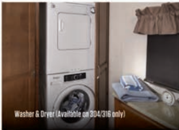
Washer & Dryer (Available on 304/316 only)