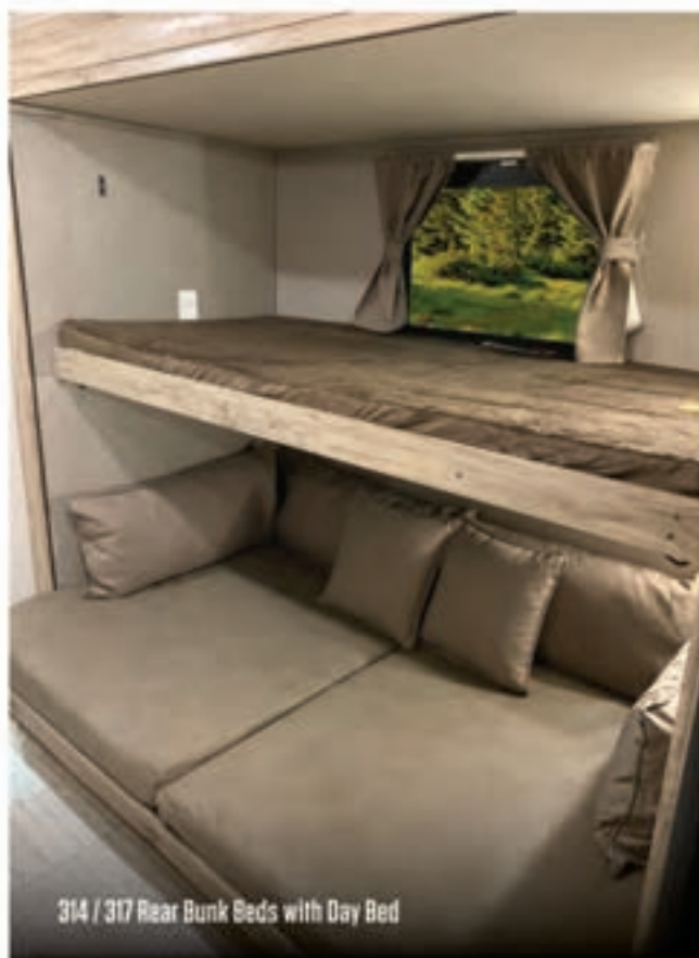
314 / 317 Rear Bunk Beds with Day Bed