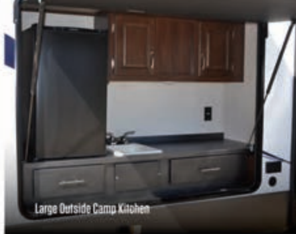
Large Outside Camp Kitchen