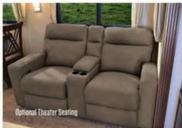
Optional Theater Seating