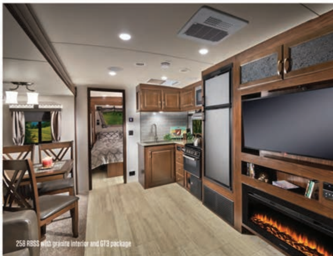
258 RBSS with granite interior and G73 package