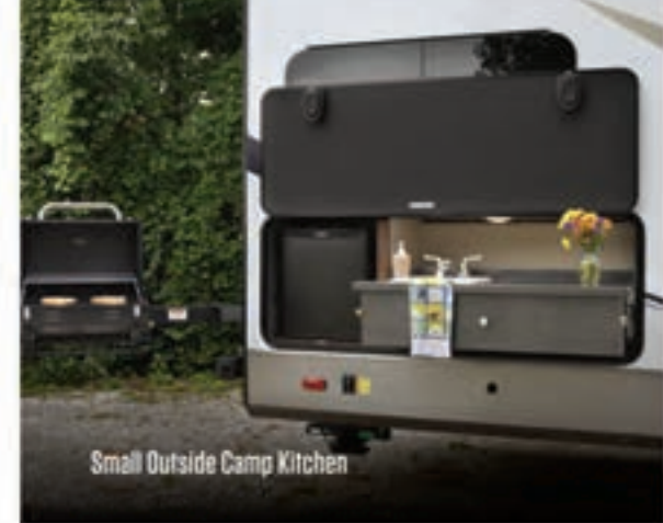
Small Outside Camp Kitchen