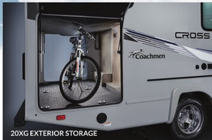
20XG EXTERIOR STORAGE