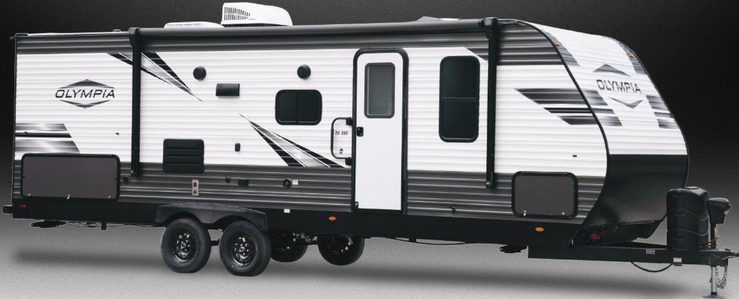
OLYMPIA SPORT Single Axle Travel Trailer