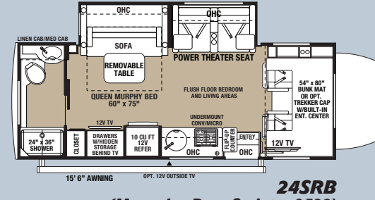
(Mercedes-Benz Sprinter 3500)