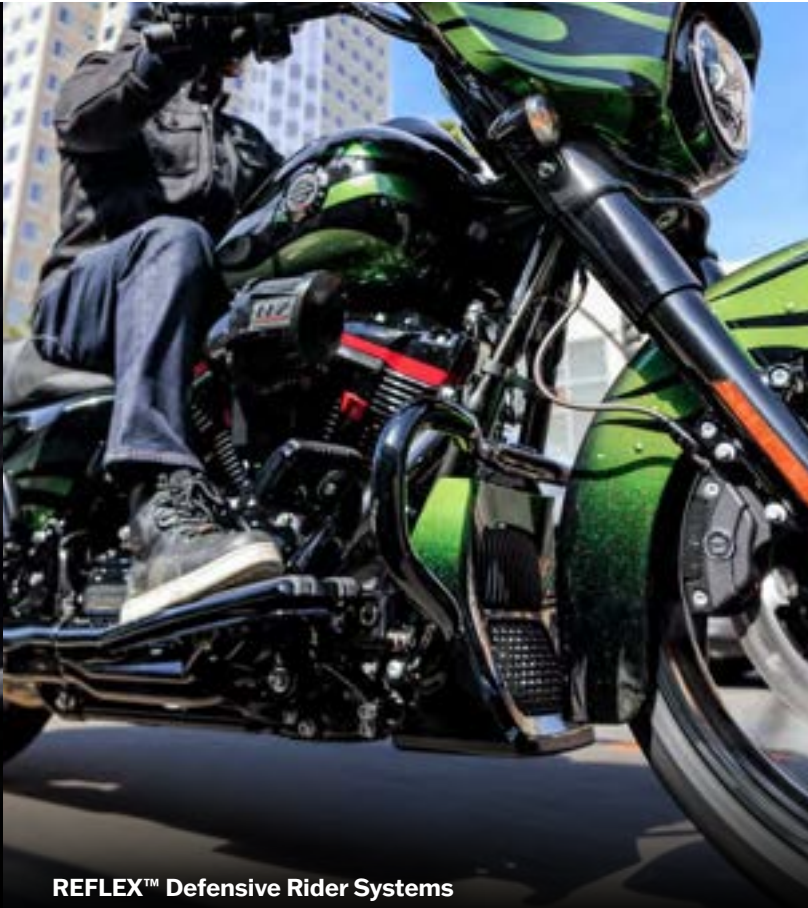
REFLEX™ Defensive Rider Systems