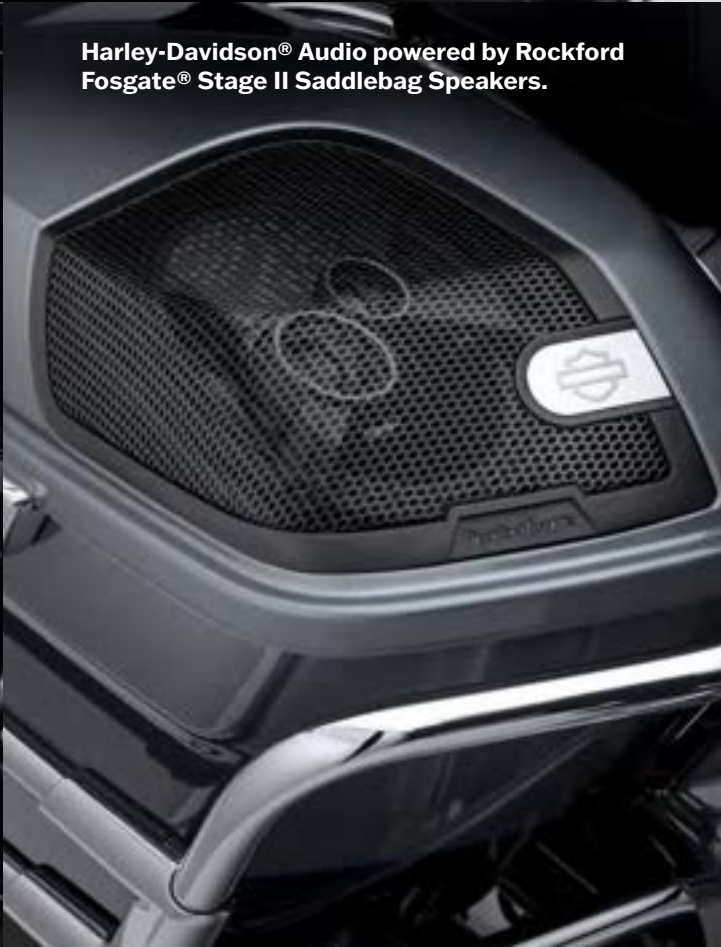
Harley-Davidson® Audio powered by Rockford Fosgate® Stage II Saddlebag Speakers.

The most powerful V-Twin engine ever offered from the H-D® factory, and only available in CVO™ models. Features colour accented Rocker Box Lower with Blaze Red finish.