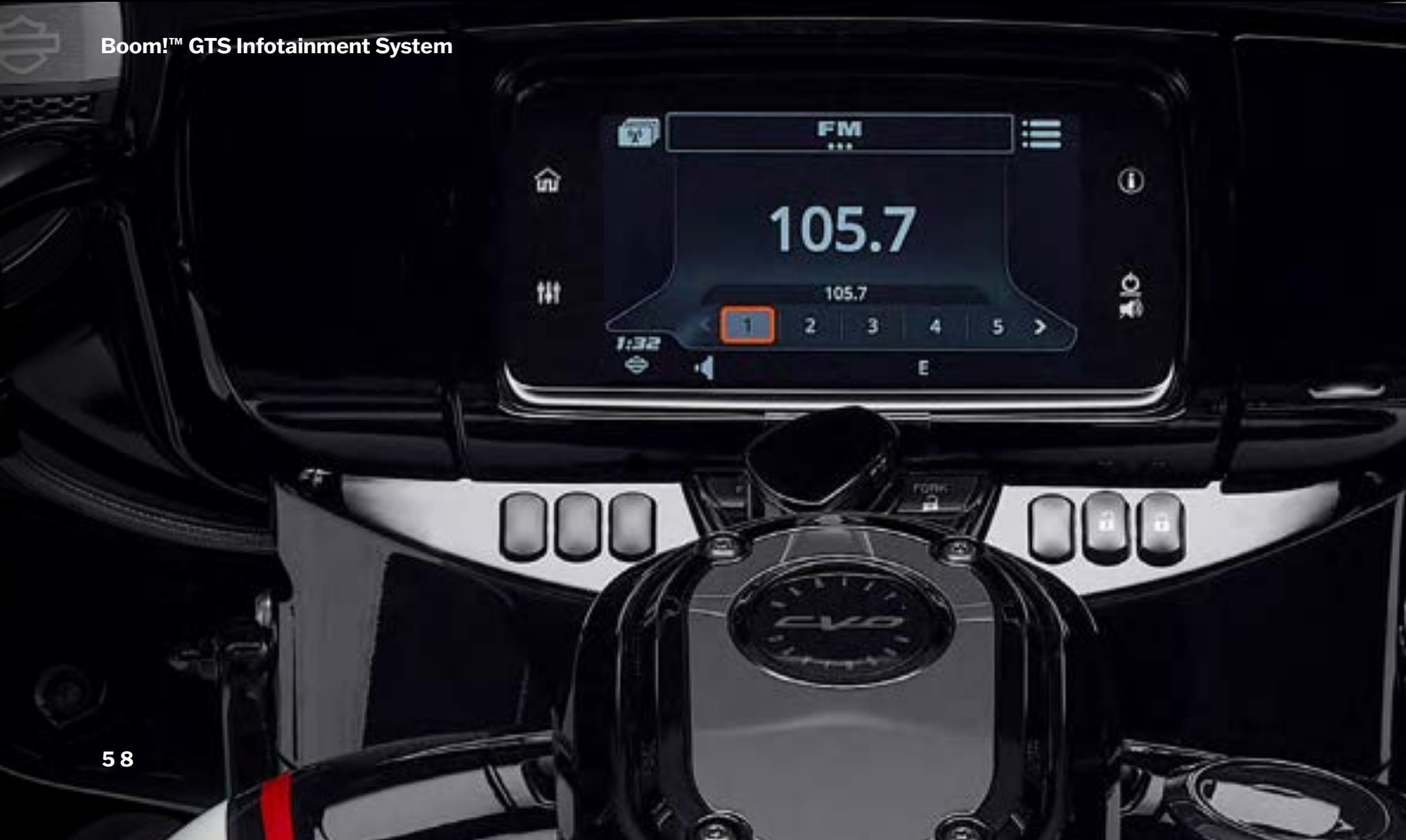
Boom!™ GTS Infotainment System