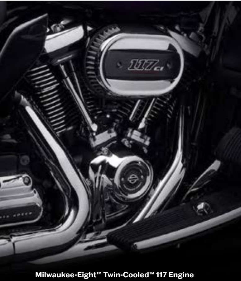
Milwaukee-Eight™ Twin-Cooled™ 117 Engine