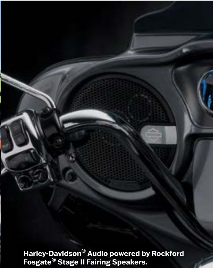
Harley-Davidson® Audio powered by Rockford Fosgate® Stage II Fairing Speakers.