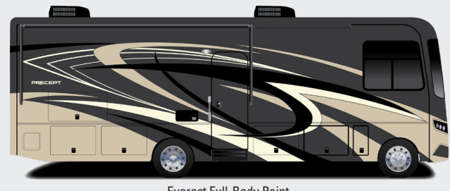
Everest Full-Body Paint