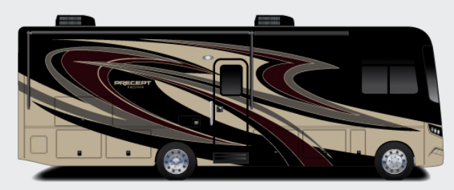
Feldspar Full-Body Paint