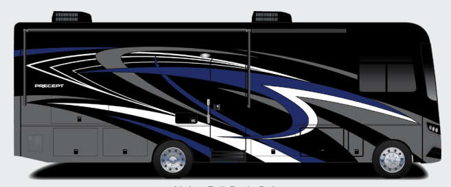
Alpine Full-Body Paint