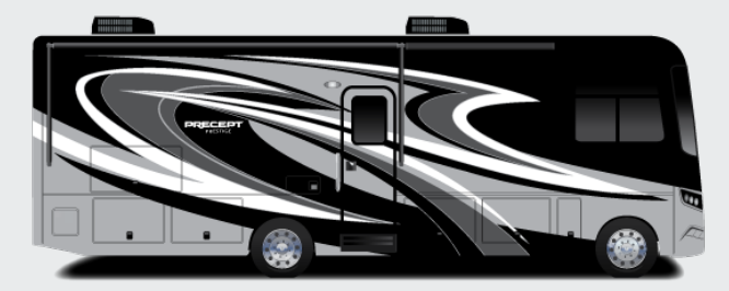
Basalt Full-Body Paint