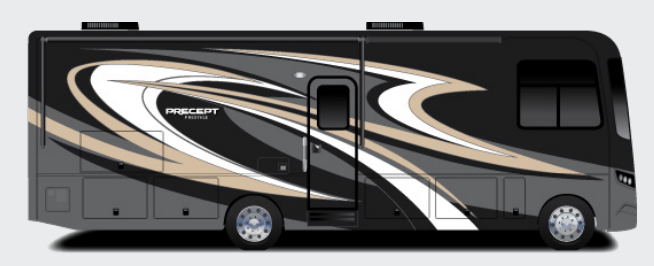
Sandstone Full-Body Paint