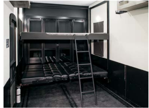
The roomy garage is versatile, functioning as a garage, bedroom, and dining area. The optional 60" x 84" power bed with sit and sleep rises and falls with ease, allowing you to customize the space to your needs.