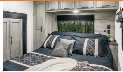
Recharge for tomorrow in the electric tilt bed with a Serta Comfort King Foam Mattress. Storage options abound, and washer/dryer prep is tucked into the closet.