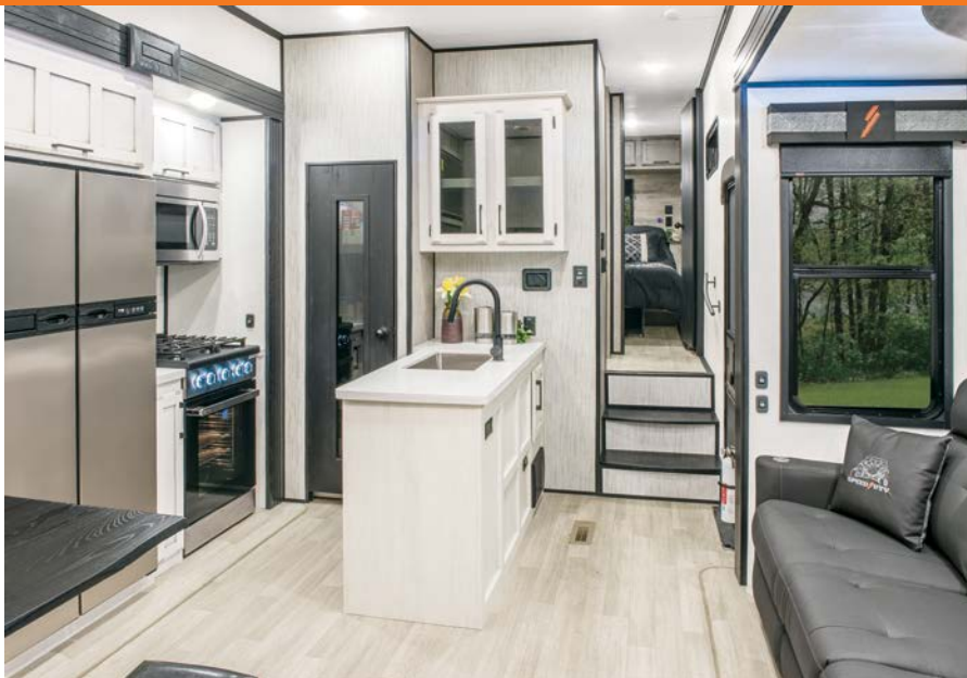
Fuel your body for the next adventure with the residential kitchen, featuring stainless steel appliances and tons of storage options.