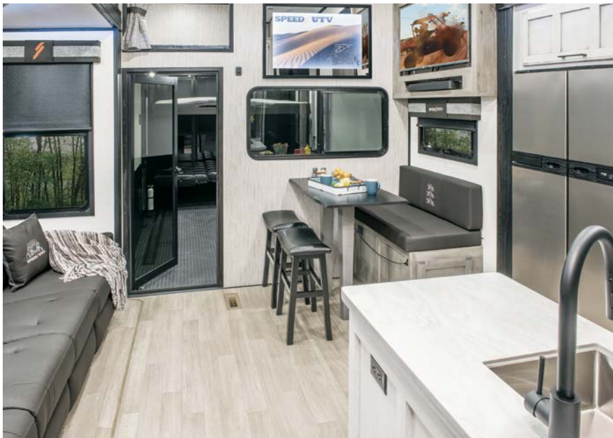
Bring the party inside! The comfy super sofa includes USB charge ports and is in perfect view of the entertainment center. Robby Gordon accents add flair to the experience.