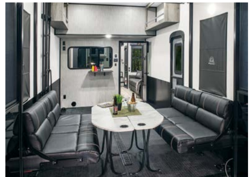
Take a much-needed break and transform the garage into a dining area. Overhead storage compartments allow you to keep your gear organized and out of the way. Elevate the experience even more with options like ramp door patio rails and the three-season patio door.