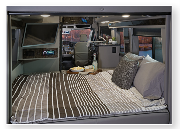
Power lounge in sleeping position

Luxury appointments and amenities abound in the Passage from Midwest Automotive Designs. Unmatched elegance and style, complimented by superior craftsmanship, fit and finish, make this luxury coach truly one of a kind.