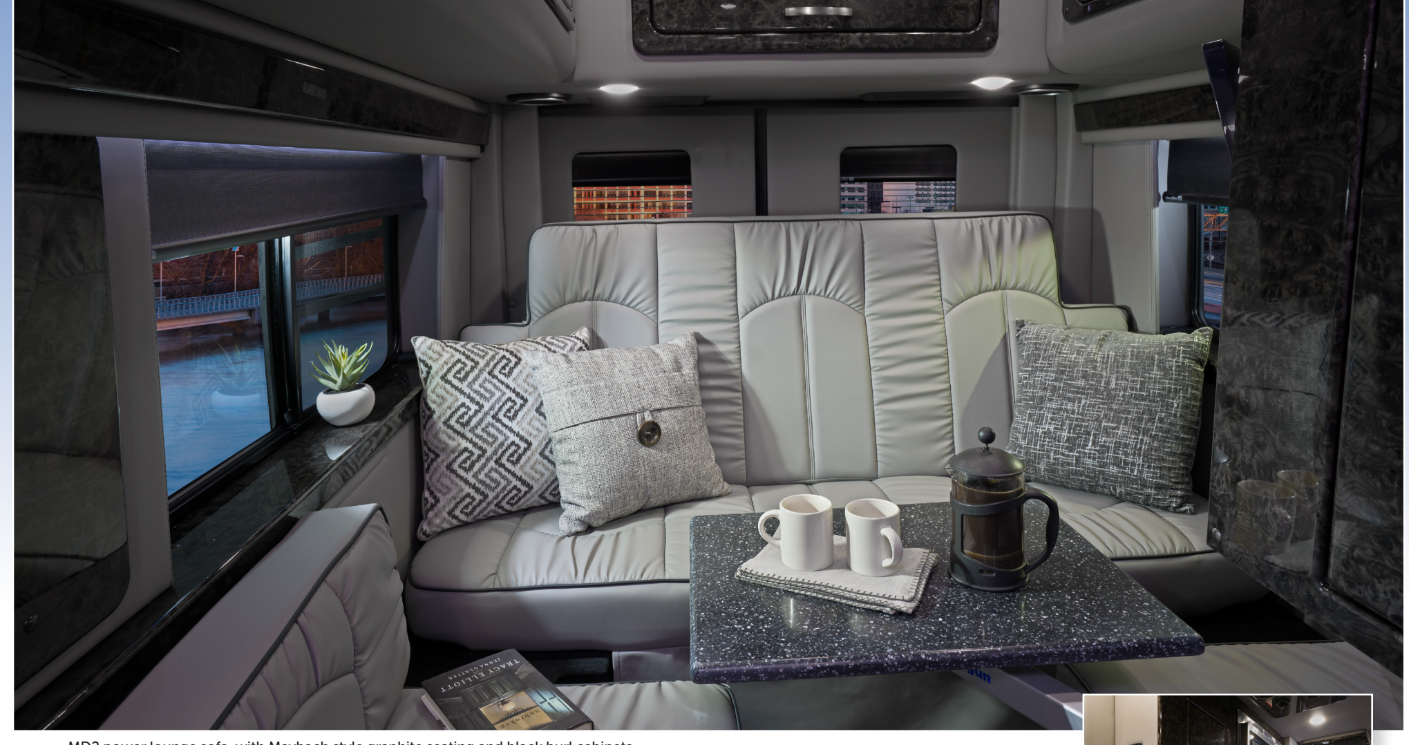
MD2 power lounge sofa, with Maybach style graphite seating and black burl cabinets.