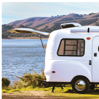
SIGNATURE REAR HATCH