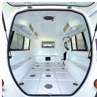
FULLY MODULAR INTERIOR