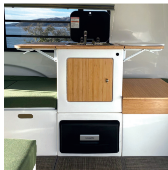
KITCHENETTE AND TOILET OPTIONS