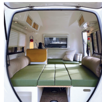
SELF-SUSTAINED AND OFF-GRID READY