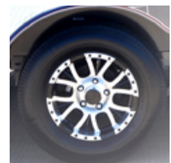
TWO TONE ALUMINUM