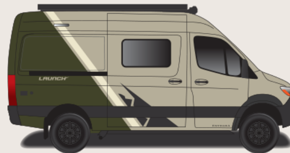
Forest Glade Partial Paint (Sandstone Van Only)