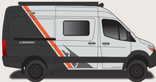
Aztec Partial Paint (Silver Van Only)