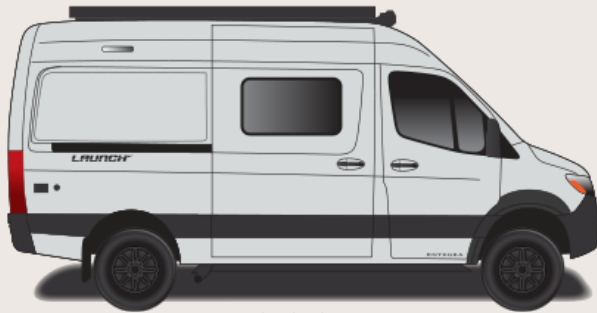
Standard Silver Van