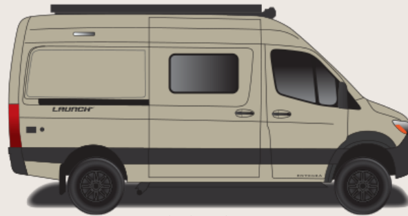
Standard Sandstone Van