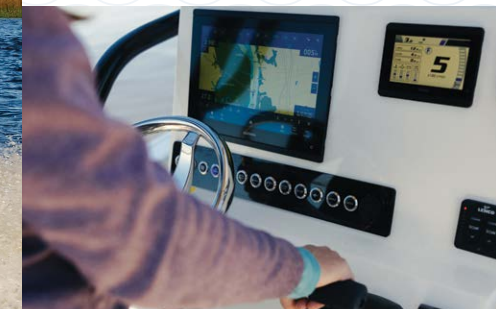
Console electronics with Garmin