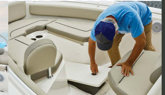
Bow seating and fish box