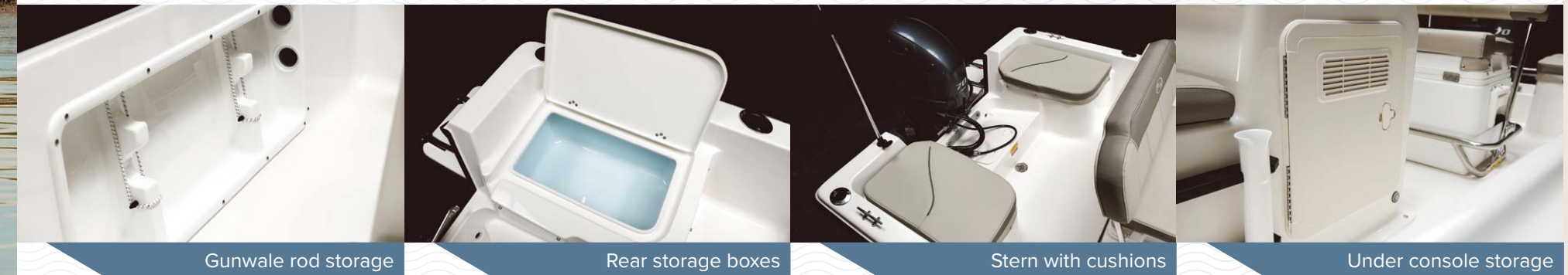
Gunwale rod storage