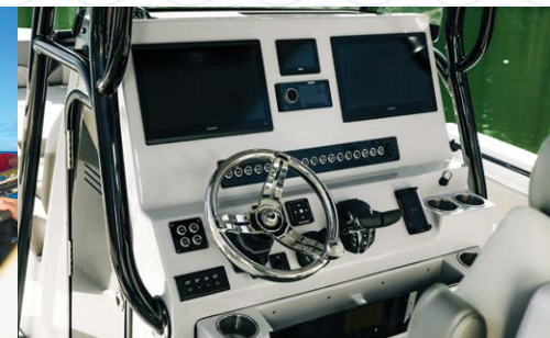
Console electronics with Garmin