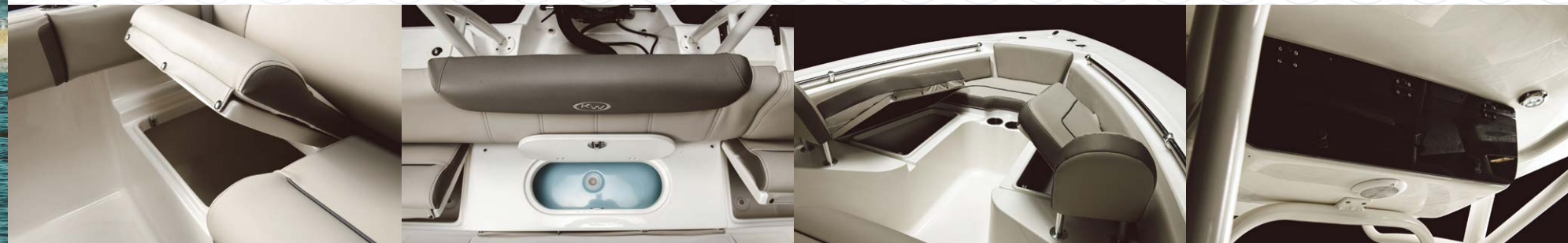
Bench seat storage