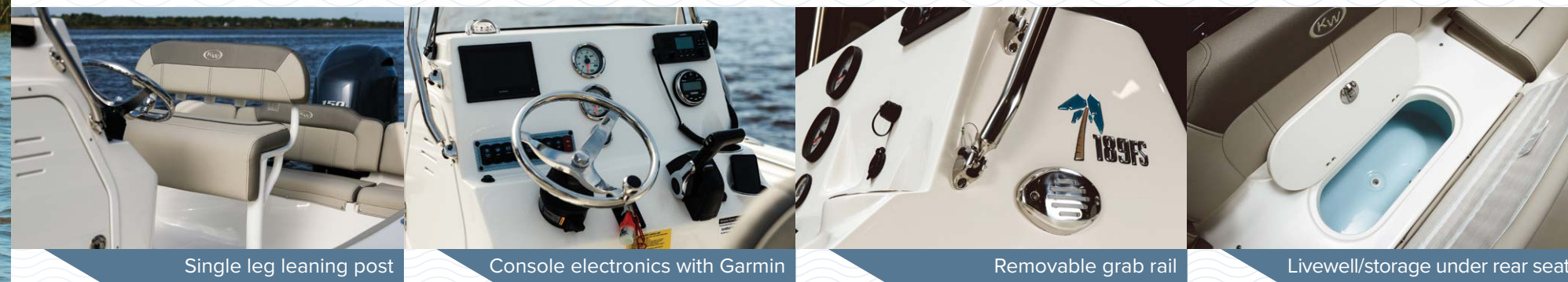
Single leg leaning post