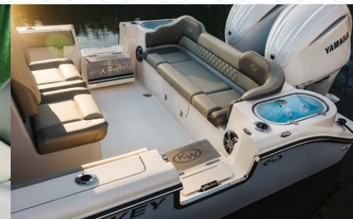
Dual side entry doors