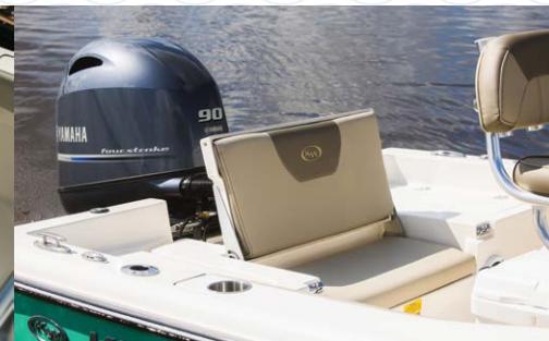
Rear folding jump seat