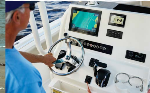
Console electronics with Garmin