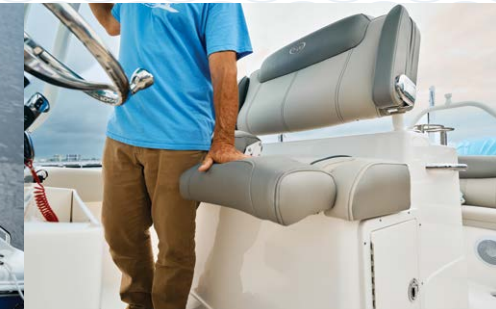
Flip bolster leaning post