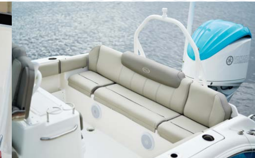
Rear bench seat