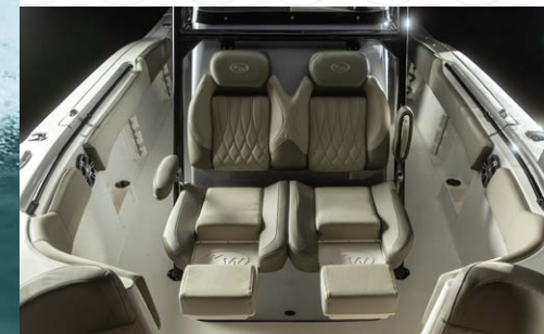
Convertible lounge seat