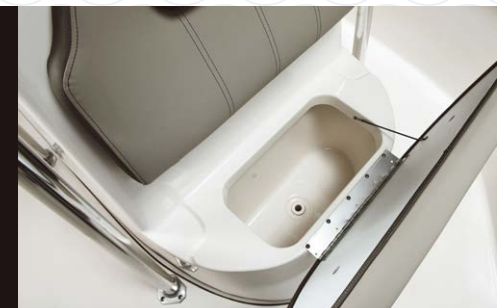
Under seat storage