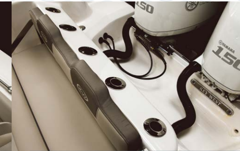
Built-in rod holders