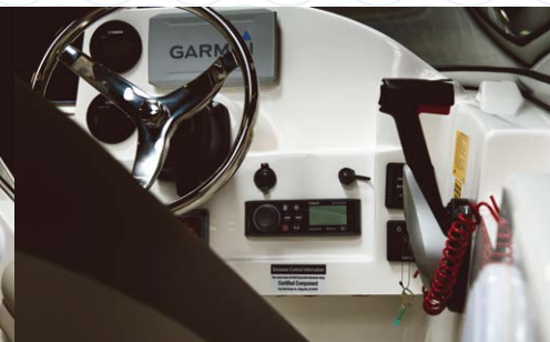
Console electronics with Garmin