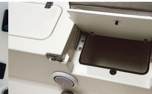
Storage under jump seats