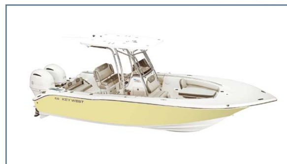
FIGHTING LADY YELLOW