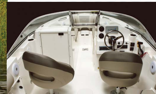
Cockpit and windshield