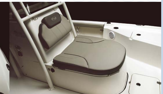
Large forward console seat