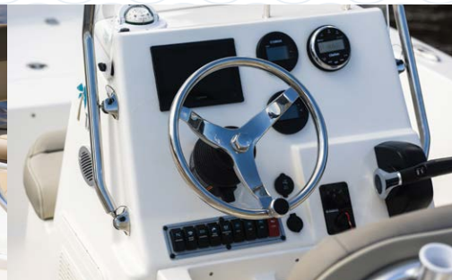
Console electronics with Garmin