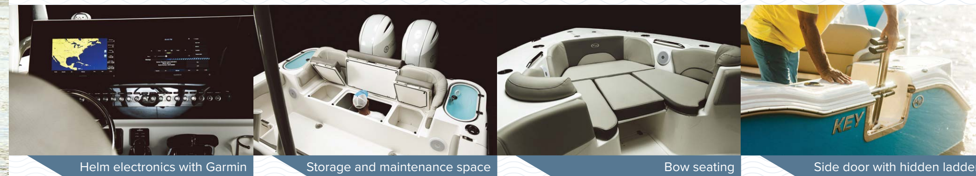
Helm electronics with Garmin