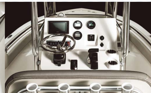
Console electronics with Garmin