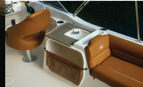
Sink with counter top