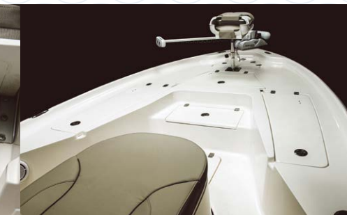
Bow deck space