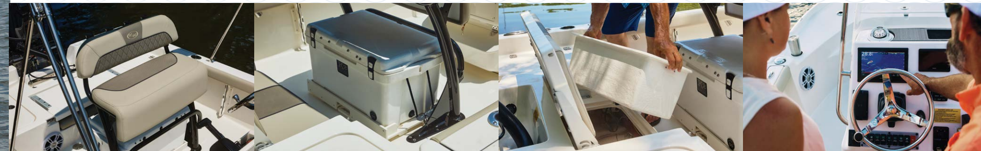
Single leg leaning post