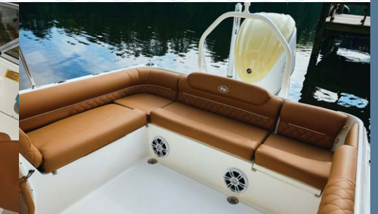
Wrap around bench seat