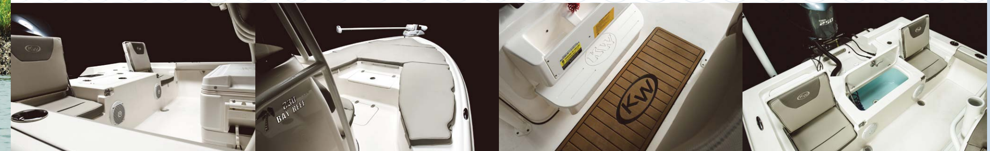
Fold away jump seats