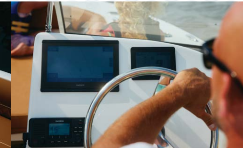
Console electronics with Garmin