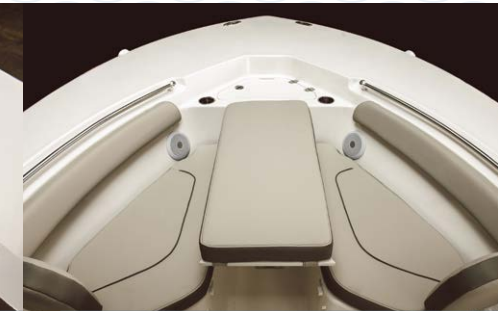
Bow seating w/ optional table