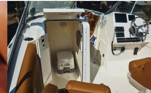
Potty room in console