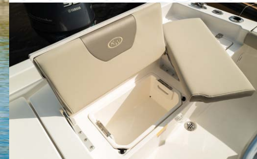
Removable seat with storage