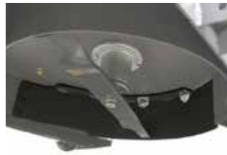
MULCH BAFFLING KIT (RT/SRT)