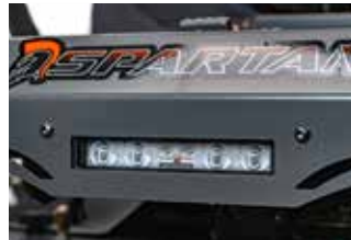
FULL BEAM LED LIGHT KIT