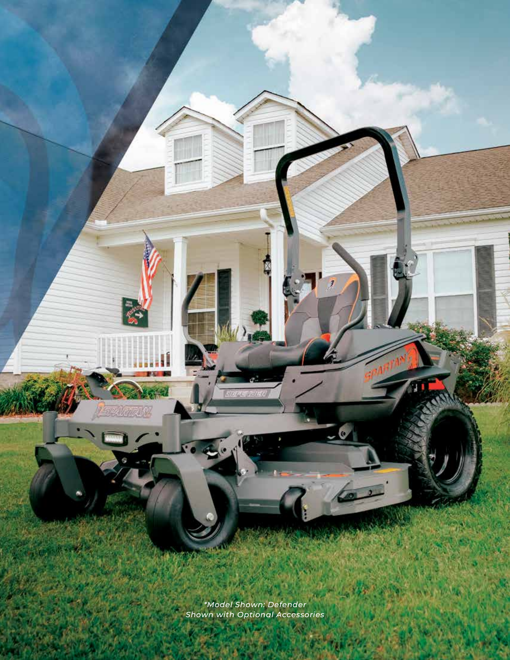
*Model Shown: Defender Shown with Optional Accessories