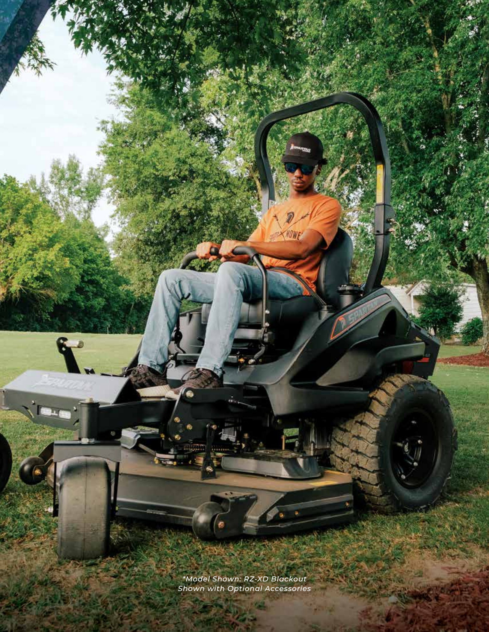
*Model Shown: RZ-XD Blackout Shown with Optional Accessories