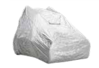
SPARTAN MOWER COVER

Upgrade Available On: RT & SRT 54" & 61"