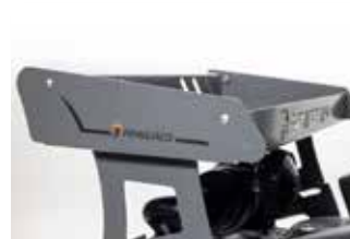
RT/SRT REAR BASKET