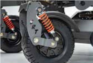
FRONT SUSPENSION FORK WITH FENDER SET