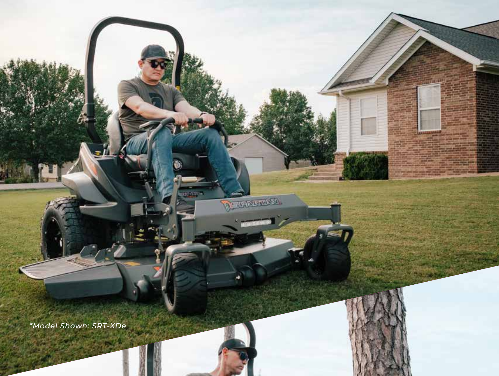
*Model Shown: SRT-XDe