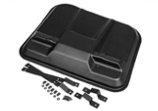
SPARTAN CANOPY ASSEMBLY