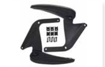
RZ ARMREST KIT

Upgrade Available On: All 54" & 61" Models All 72" Models