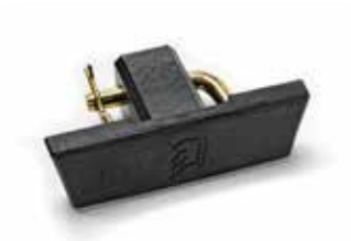
REAR NYLON BUMPER