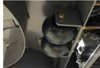
REAR ANTI-SCALP ASSEMBLY