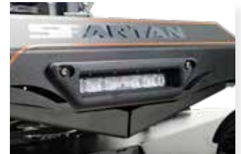
FRONT NYLON BUMPER

Upgrade Available On: RT & SRT Models Only