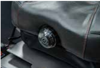
FULL SUSPENSION KIT