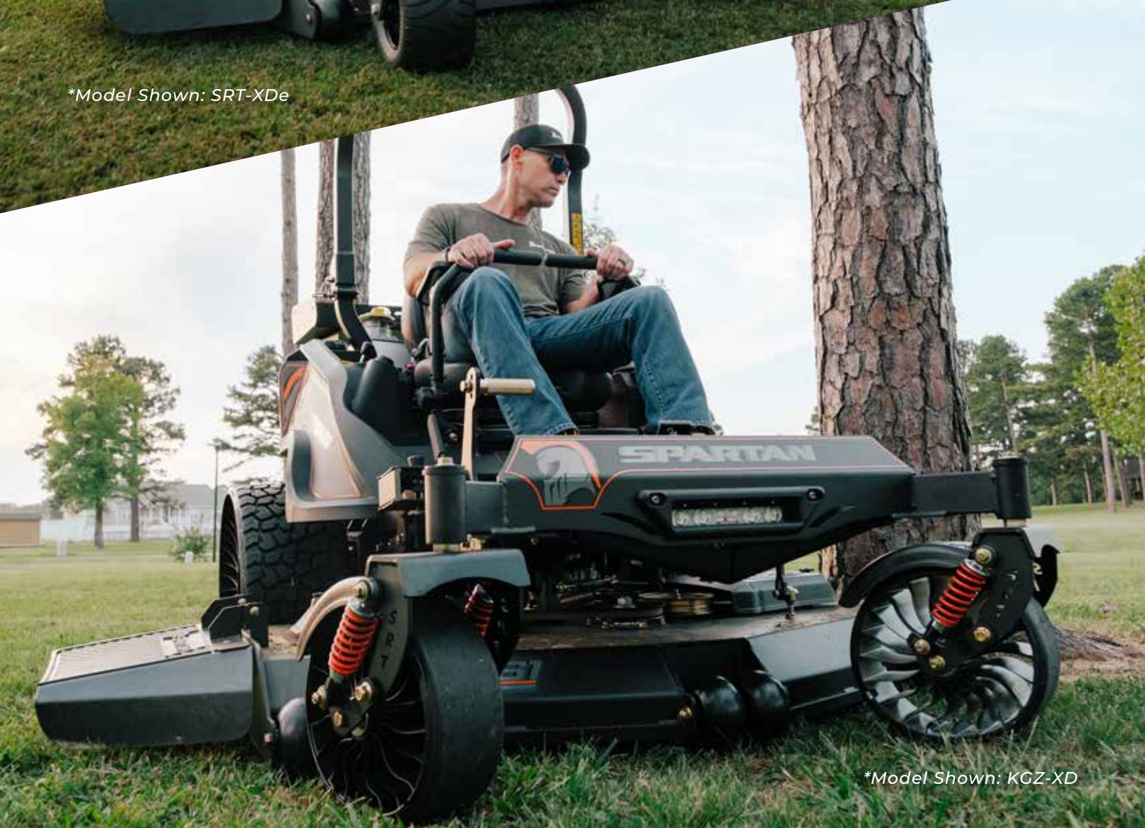
*Model Shown: KGZ-XD