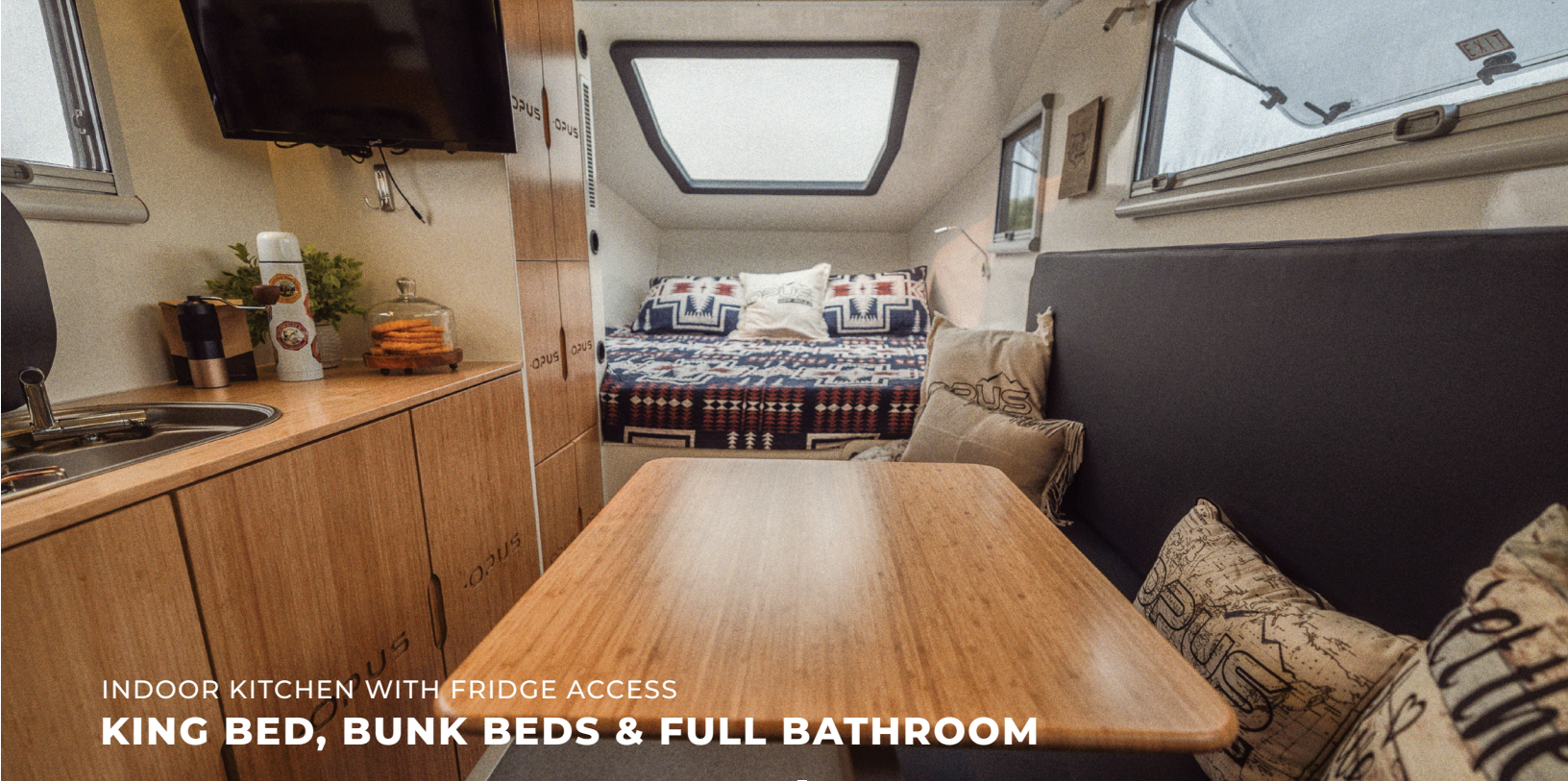
INDOOR KITCHEN WITH FRIDGE ACCESS KING BED, BUNK BEDS & FULL BATHROOM