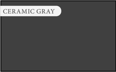
USA - ONLY

Use your phone's camera to find out more information. Just scan the code!