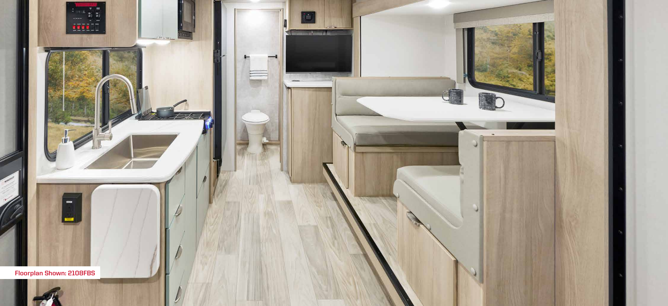
Floorplan Shown: 2108FBS

An intuitive control panel saves steps by locating key system controls in one convenient location.