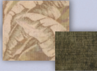
Living Room Coordinate