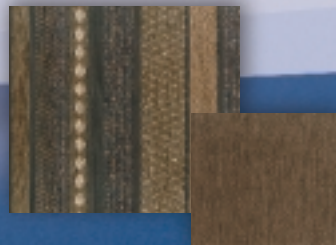
Living Room Coordinate