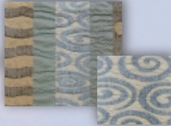
Living Room Coordinate