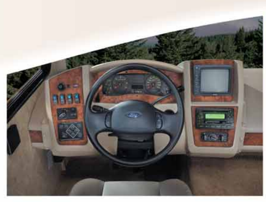
Pursuit is designed for maximum driver comfort and safety. This automotive style dash puts the controls at your fingertips. A standard 7" rear vision camera increases visibility.

When the weekend comes, it's time to pursue the truly good things in life, with the confidence that comes from knowing the keys to your next adventure are in hand. Most people only dream of the perfect weekend getaway. Yours is a dream come true behind the wheel of the Pursuit by Georgie Boy.