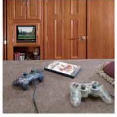
The 3540 DS floorplan features a standard bunk bed/ entertainment zone that creates the ultimate getaway for younger travelers or adults. A standard 15" LCD television with auxiliary hook ups makes for carefree rest and recreation. (3540 DS only)