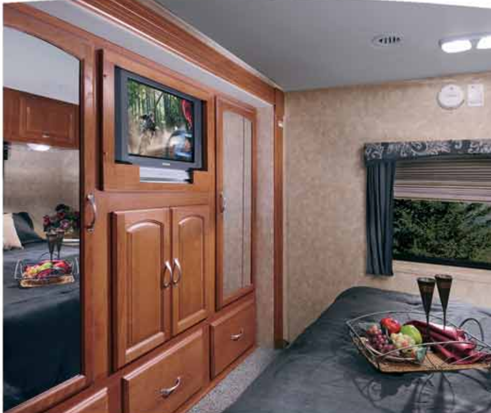
Pursuit's large bedroom windows with pleated shades allow natural light during the day and plenty of privacy after dark.