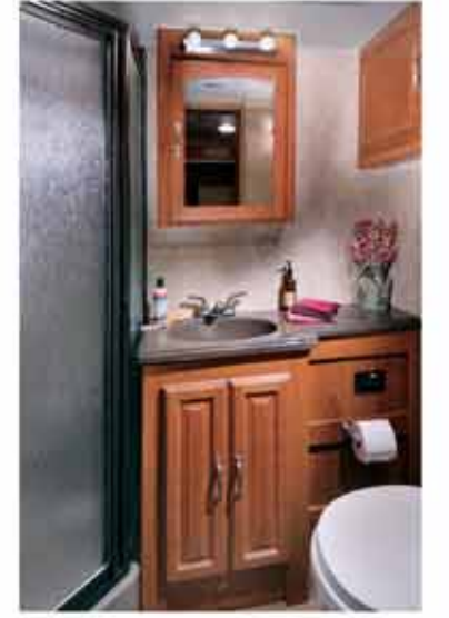
The well equipped bath area features a glass shower door, porcelain foot-flush toilet and designer faucet.