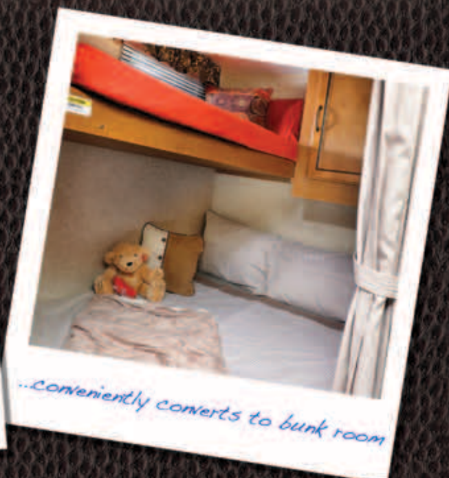
...conveniently converts to bunk room