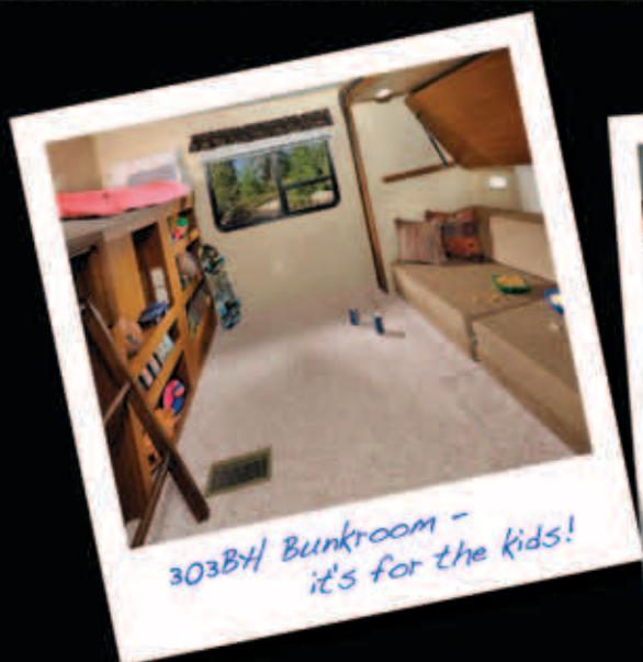
303BH Bunkroom - it's for the kids!

You not only want to feel good while camping you want to look good too, Springdale went all out for this Adventure. Our interiors capture the true essence of modern and contemporary style blended with progressive accents that will make you the envy of the campsite. Form and function do meet with Springdale. Whether it's large bunkrooms, or large