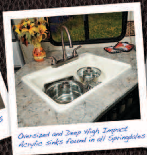
Oversized and Deep High Impact Acrylic sinks found in all Springdales