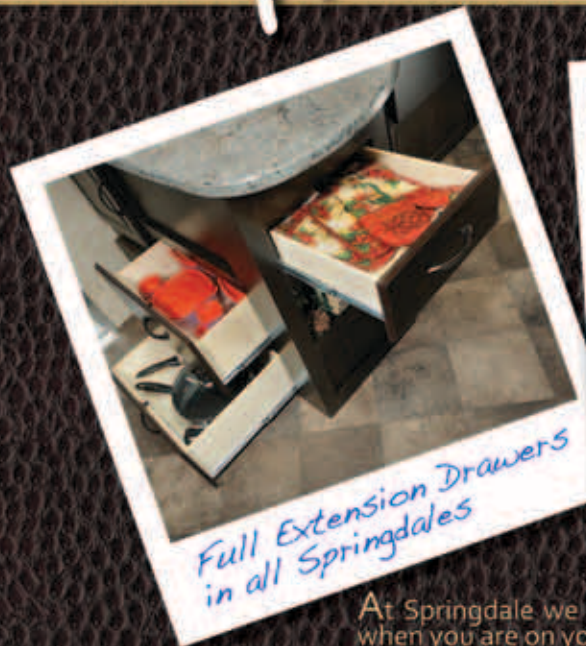
Full Extension Drawers in all Springdales