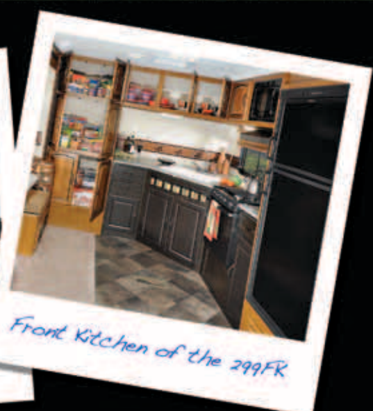
Front Kitchen of the 299FK