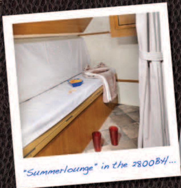
"Summerlounge" in the 2800BH/...