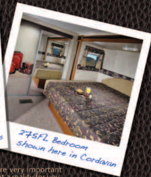
275FL Bedroom shown here in Cordavan

At Springdale we know that convenience and comfort are very important when you are on your Adventure and we strive to make that a reality for you. The Galley's make prep work to cleanup effortless. All Springdales have full extension pull out drawers and deep sinks that make the most experienced camper happy. Large bedrooms and room to roam in the main living areas make the Springdale easy to navigate for the entire camping crew!